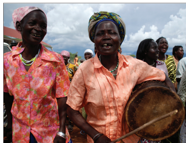
Women celebrating the handover

In March 2007, ActionAid Uganda undertook an assessment of the situation in the returnees' areas of Greater Ngenge that was still part of Kapchorwa District but presently in the newly created Kween District focusing on the three resettlement camps of Giriki, Korite and Sundet camps. The assessment revealed that Giriki resettlement camp had the highest number of returnee's (i.e. 1,000 people) facing the biggest challenges. Since then, the number of people returning has continued to build up and more resettlements areas have come up. The total number of settlers now in Giriki stands at about 7,015 (District Planning unit-Kween DLG, 2012)