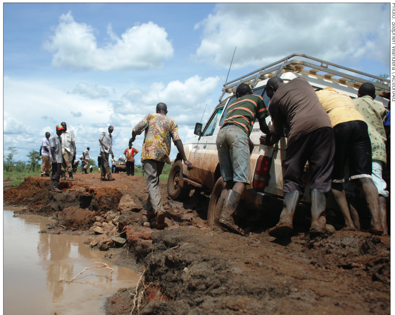
Roads turned into mud and even the Land Cruisers cannot pass. Lack of infrastructure is a major problem in the district.

As we waited, a UPDF Soldier coming from the opposite side of the road arrives, with four other people (one dead) on another bodaboda. It was sad to hear the story of how his young 4-year old son died of malaria on the same road because they couldn't reach the Health Centre in time. He was returning to Kapchorwa, the nearby district to arrange for his son's burial. When I showed deepest sympathies, he looked up at me and said, ' my friend, this is the life we live... ' I gave him 30,000 Uganda shillings (about 12 USD) as my modest contribution and his response, ' ...may God Bless you and have a successful journey... ' Indeed God listened to him and blessed us with a successful trip.