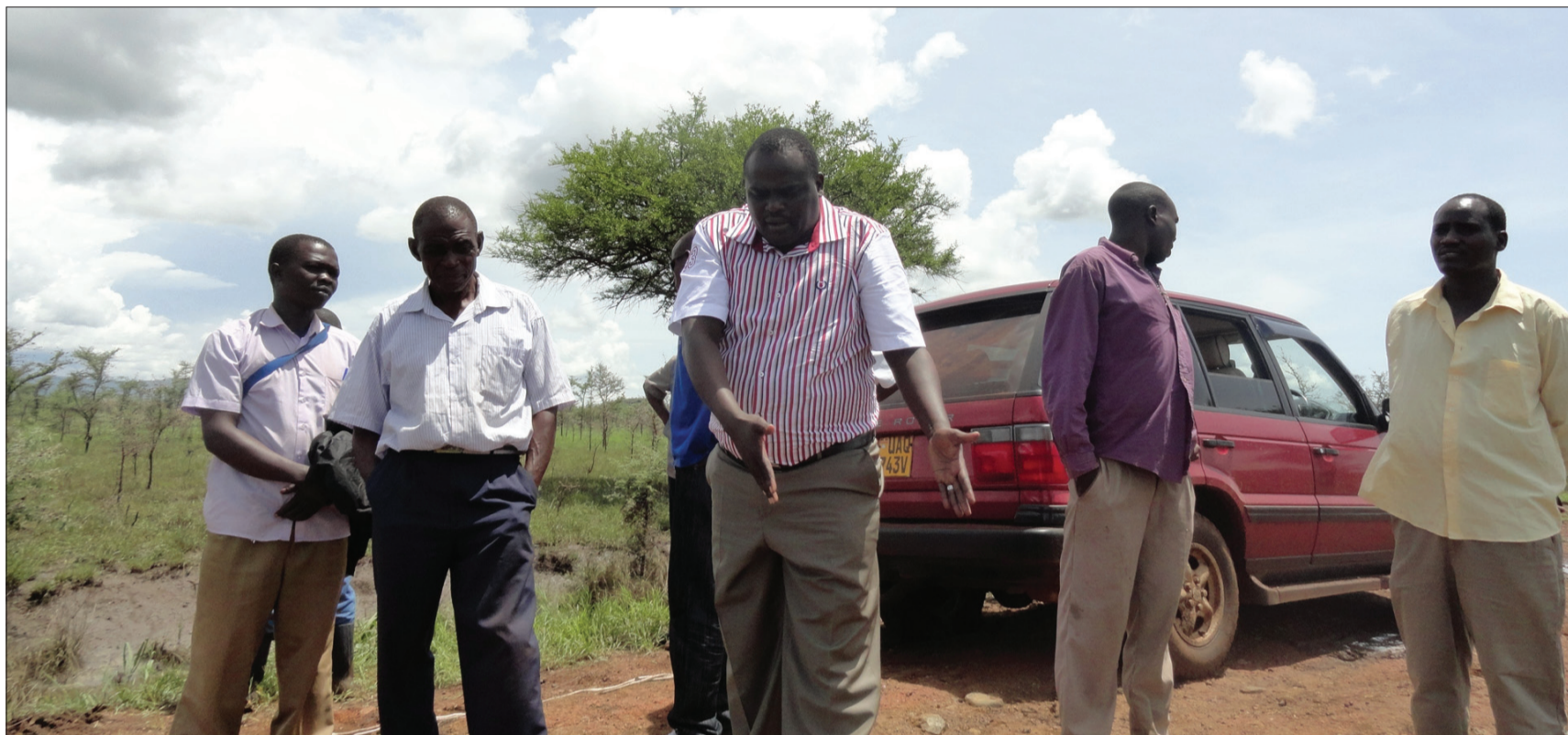
Kween MP, Hon. Kisos Chemaswet, engaging with the citizens on the role of MPs in ensuring good roads.