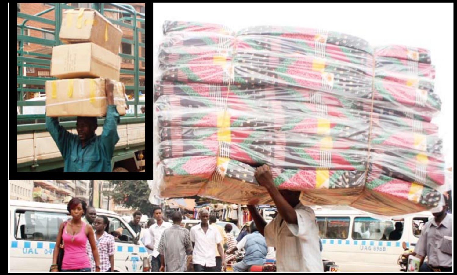
Will the Ugandan Youth ever get out of such suffering when a few individuals are stealing their relatives savings?"