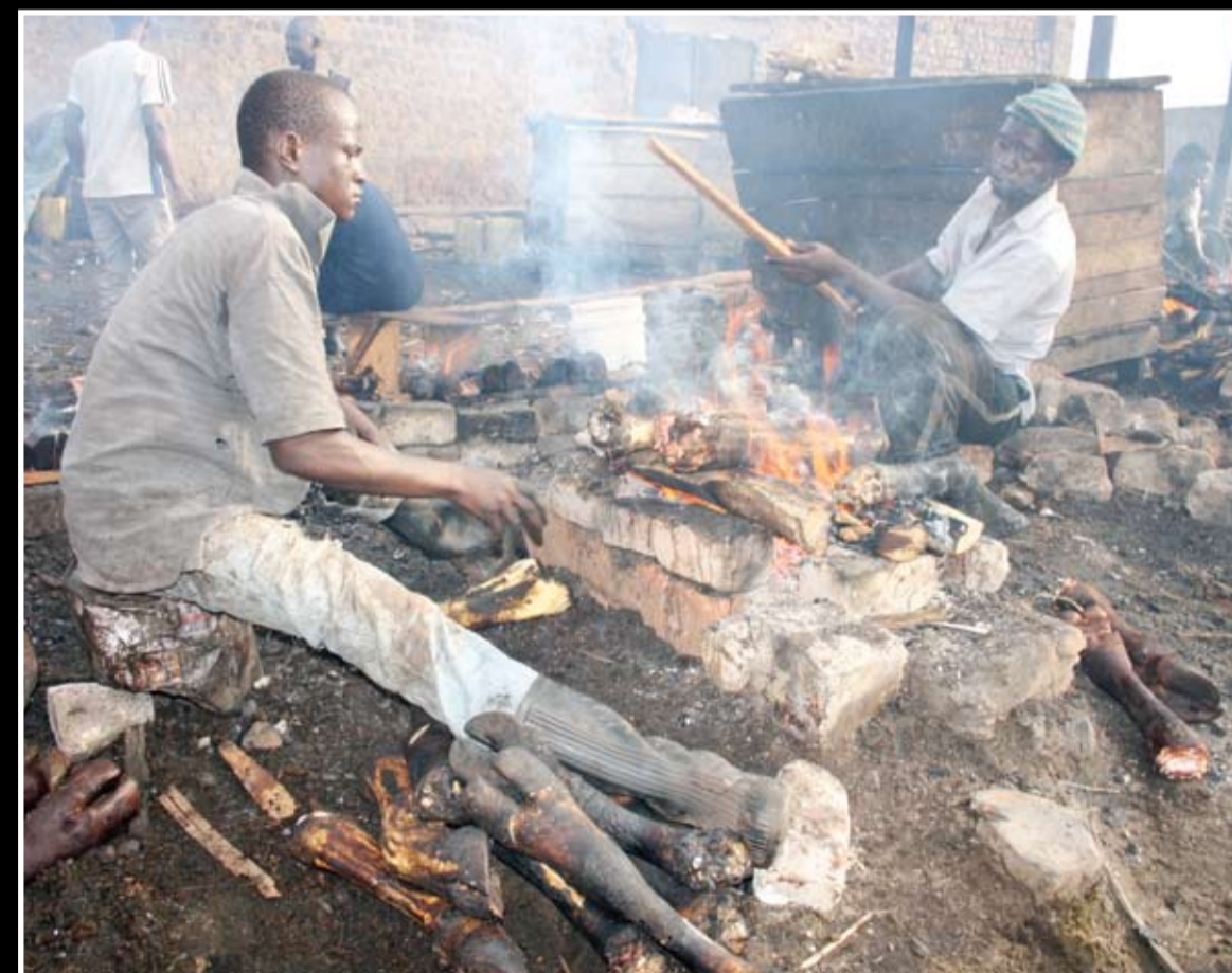
How will Museveni's Cash Bonanza reach such Youth who toil day and night to make a living