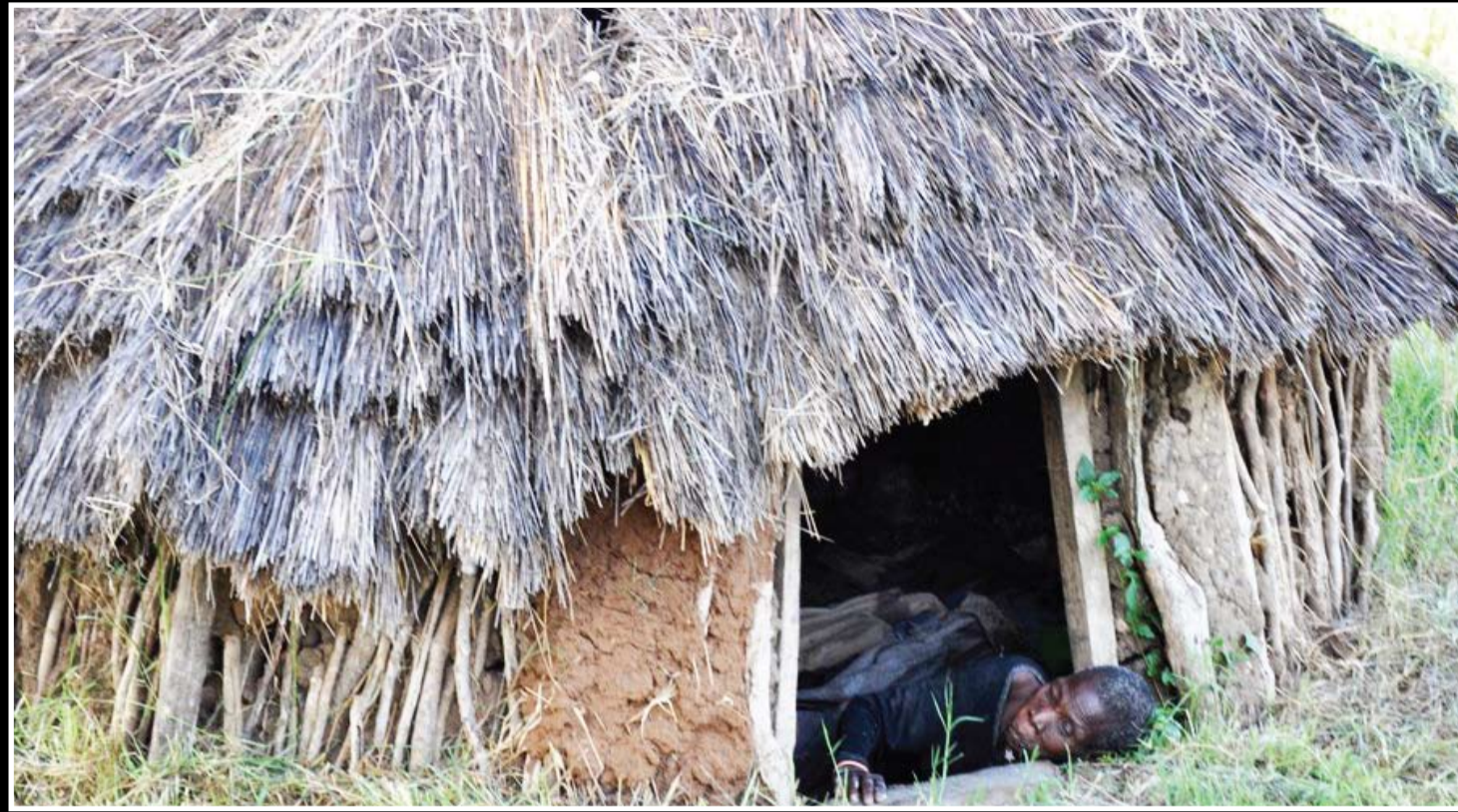
After decades of hard work, this is how a Ugandan worker rots away: Who is responsible for the Social Security for such Workers?