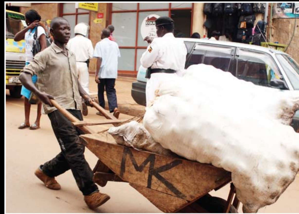
Where do Jua Kali Youth find their Social Security, who is responsible for their rights?