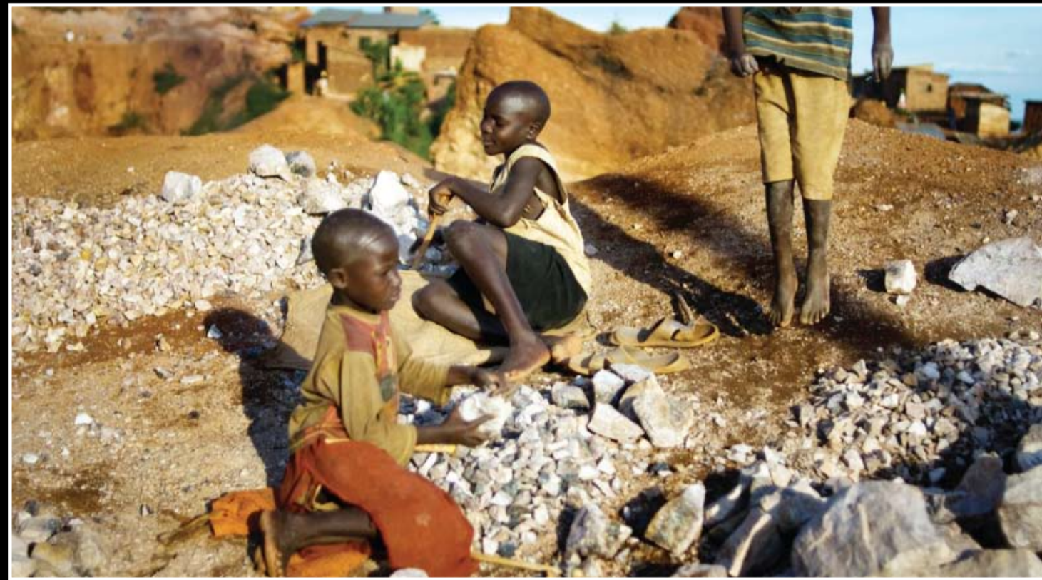
Children wasting away their childhood in a stone quarry in Kireka, what kind of Labor Force can such childhood promise?