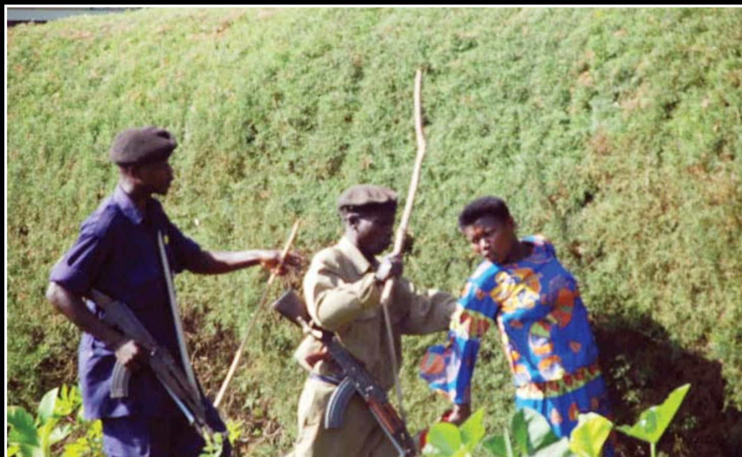
Slavery in own Country: Uganda Police Force molests a worker protesting bad working conditions and poor pay at Rose Bud Flower Plant in 2009