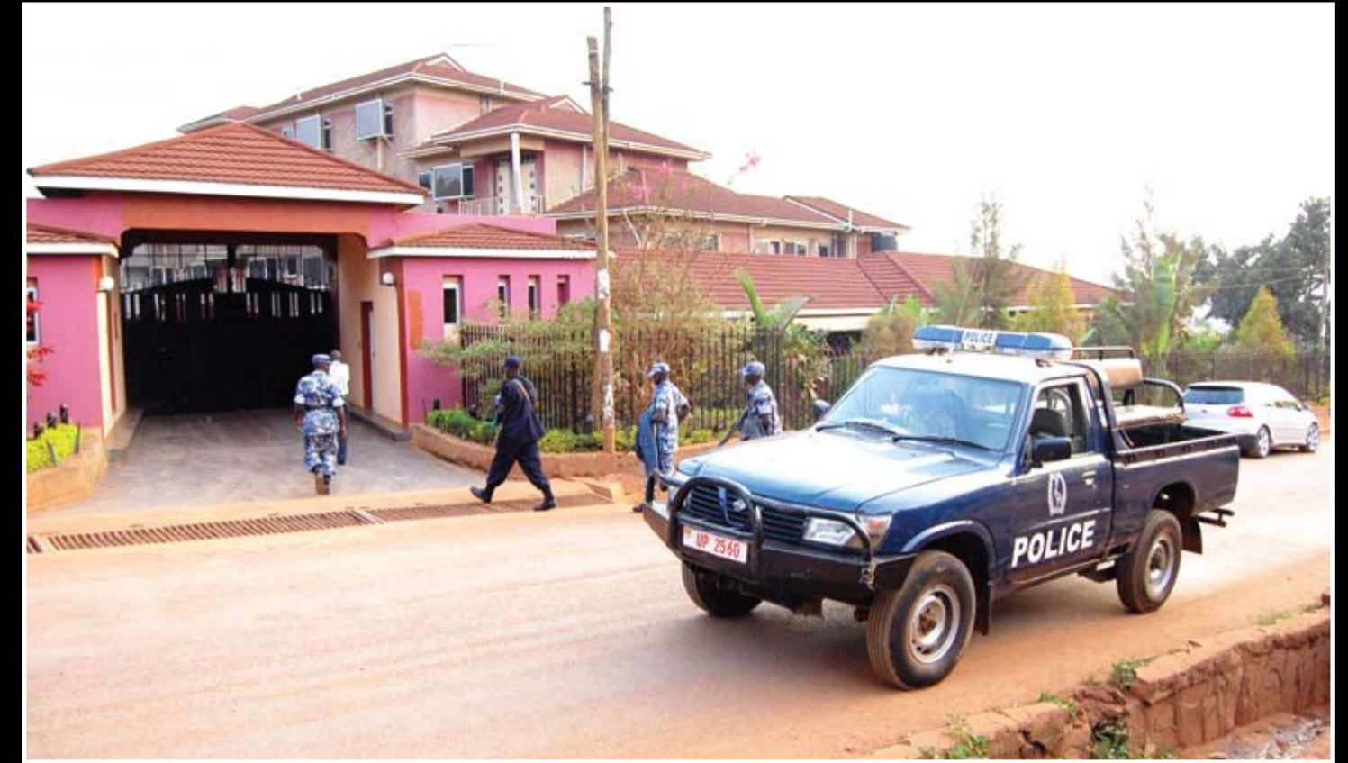
Now we have the answer, it all ends up in such Palaces for the lucky few that are in control of our Taxes.