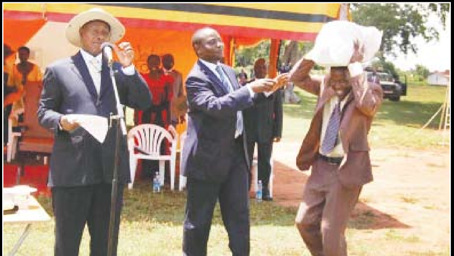
Museveni's Cash Bonanza to the Youth: Will it solve Uganda's Unemployment Crisis?

One of the biggest categories of people that have suffered from this theft is workers and workers' unions which play an important part in the economy. While workers' unions exist, they are not strong enough to influence wage levels or welfare standards for workers in industries and enterprises. Today, it is common to see workers who have been severely injured while at work in factories and not given sufficient medical attention. In the hotel industry, workers have been turned into casual labourers. A poverty study in the late 1990s that was done at the Ministry of Finance narrated stories of workers who could never meet their daily sugarcane cutting quotas set by their employers because they gave them limits that could never be accomplished by a human being, and they would always receive half pay.