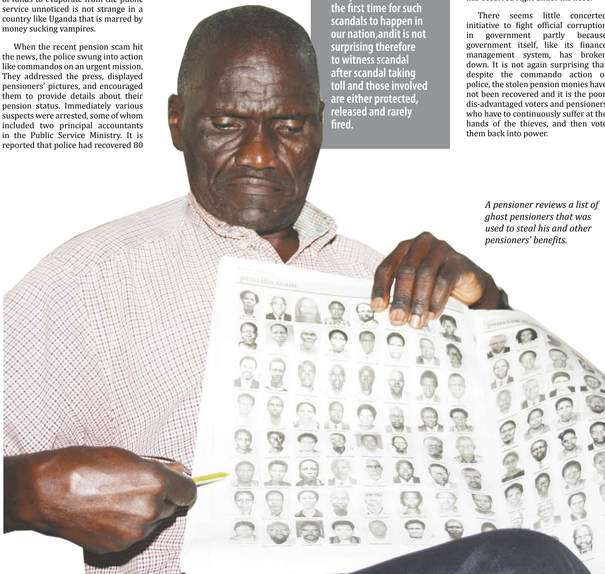
A pensioner reviews a list of ghost pensioners that was used to steal his and other pensioners' benefits.

It is laughable that our government still thinks of measures of hunting the rat when it has already escaped. Yet this is not the first time for such scandals to happen in our nation, and it is not surprising therefore to witness scandal after scandal taking toll and those involved are either protected, released and rarely fired.