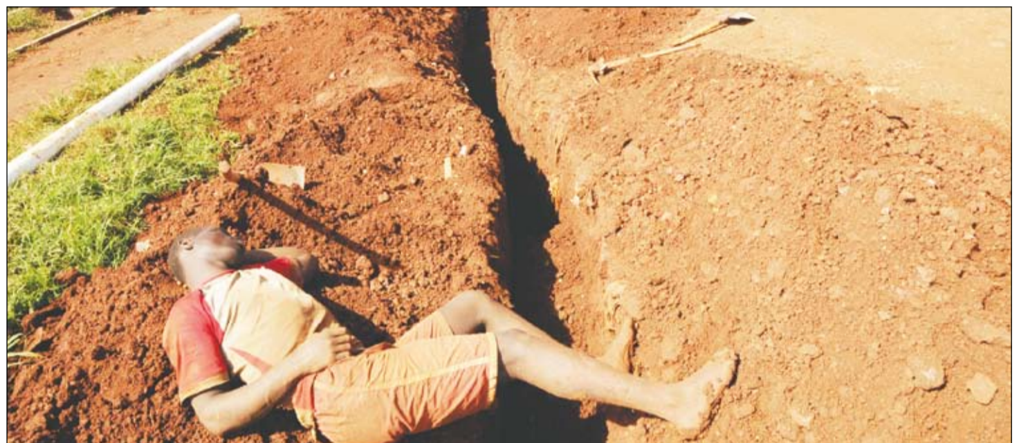
Before President Museveni rubbishes the demand for a minimum wage, he should think of this youth who is exploited by his so called Foreign investors!

Corruption in the public employment sector is anchored to nepotism that is based on political patronage as well as ethnicity. The most favoured are connected to the "right" people in the regime. This has further fuelled the theft of public funds. Corruption has become a "family affair", and whistle blowers fear not only for their jobs but 'blowing the whistle against "un-touchable". As a result, the disgruntled employees find ways to follow the example of their bosses - cutting corners and taking home as much as they can, making sure there