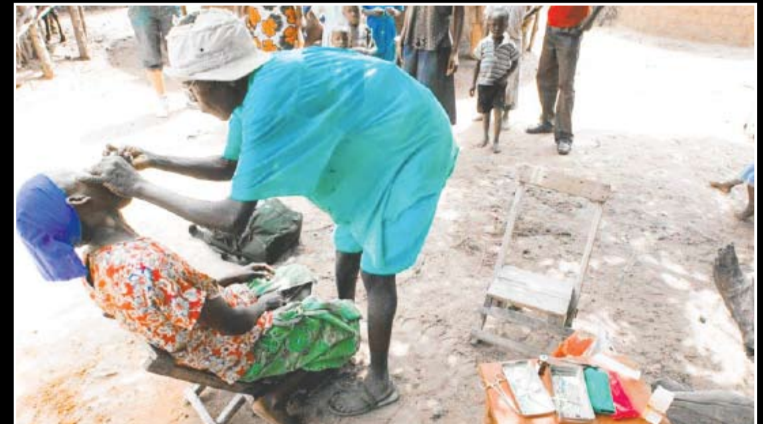
Is this the appropriate Health Care for the Ugandan worker? Where do their taxes go?