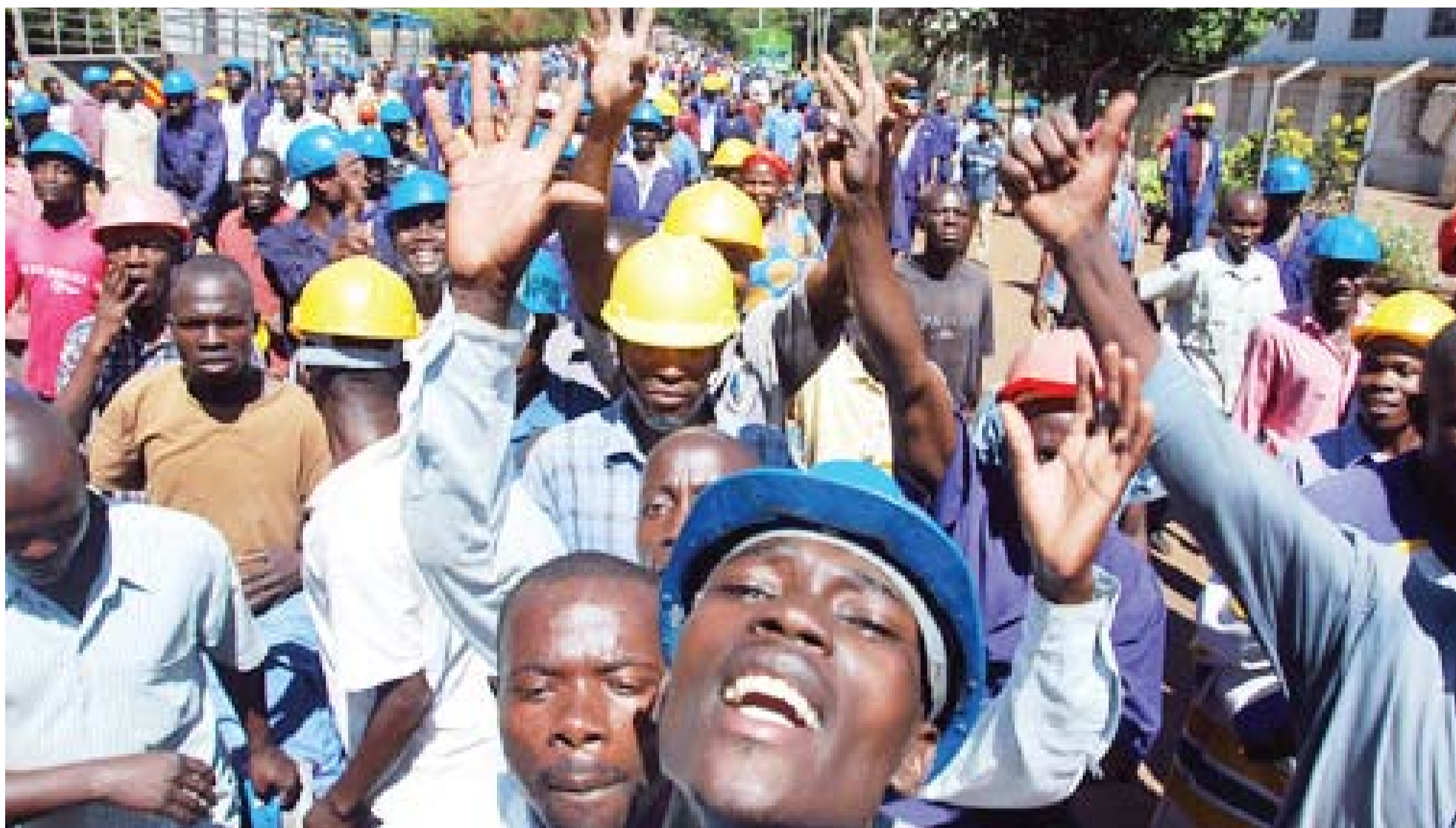
Workers of Kakira Sugar works protest poor pay and poor working conditions, Have they ever had these problems resolved? Where are the Trade Unions in all this?

In 2011 and 2012 the Uganda Teachers Union spearheaded over seven strikes protesting the poor working conditions and low pay of their members. The Teachers demanded 100% increase which would see their salary increase from UGX 270,000 to only UGX 540,000 a month. The response by the government was purportedly promising a UGX 30,000 increment per month.