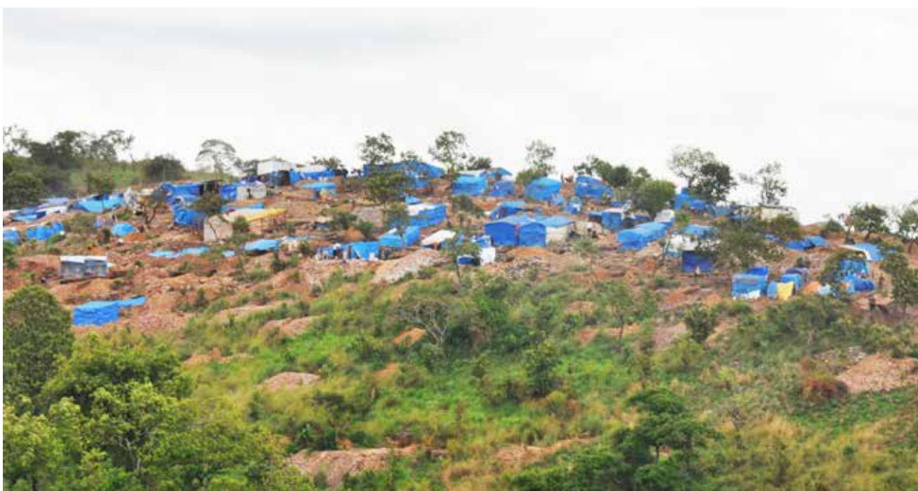
A distant view of the outskirts of a gold mining camp in Mubende.