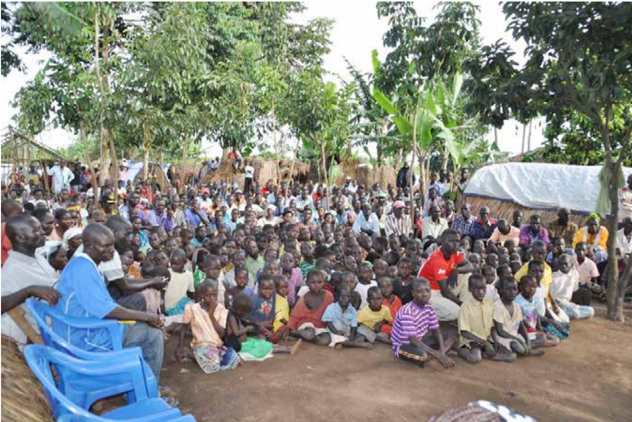
A meeting of the displaced families in Rwamutonga, Hoima. Court ruled that they were illegally evicted from their land but did not reinstate them. They are now suing the Attorney General for violation of their human rights.

The legislator added that many of his voters are currently embroiled in conflicts with wealthy businessmen over ownership of their land. Some of the land under contention has been proposed to host a Central Processing Facility (CPF) near the Kasemene oil field in Buliisa Town Council.