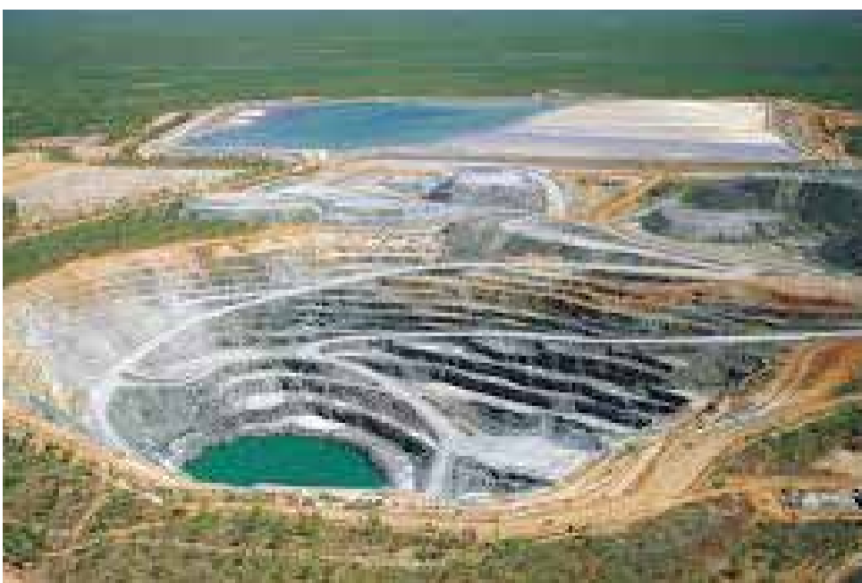
An aerial view of a Uranium mine in Australia.