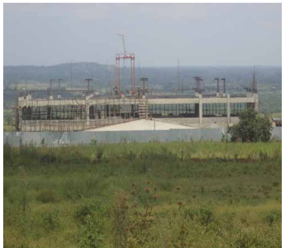
An upcoming office complex for Guangzhou Dongsong. This is the only development on the land so far. Actual mining is yet to start.