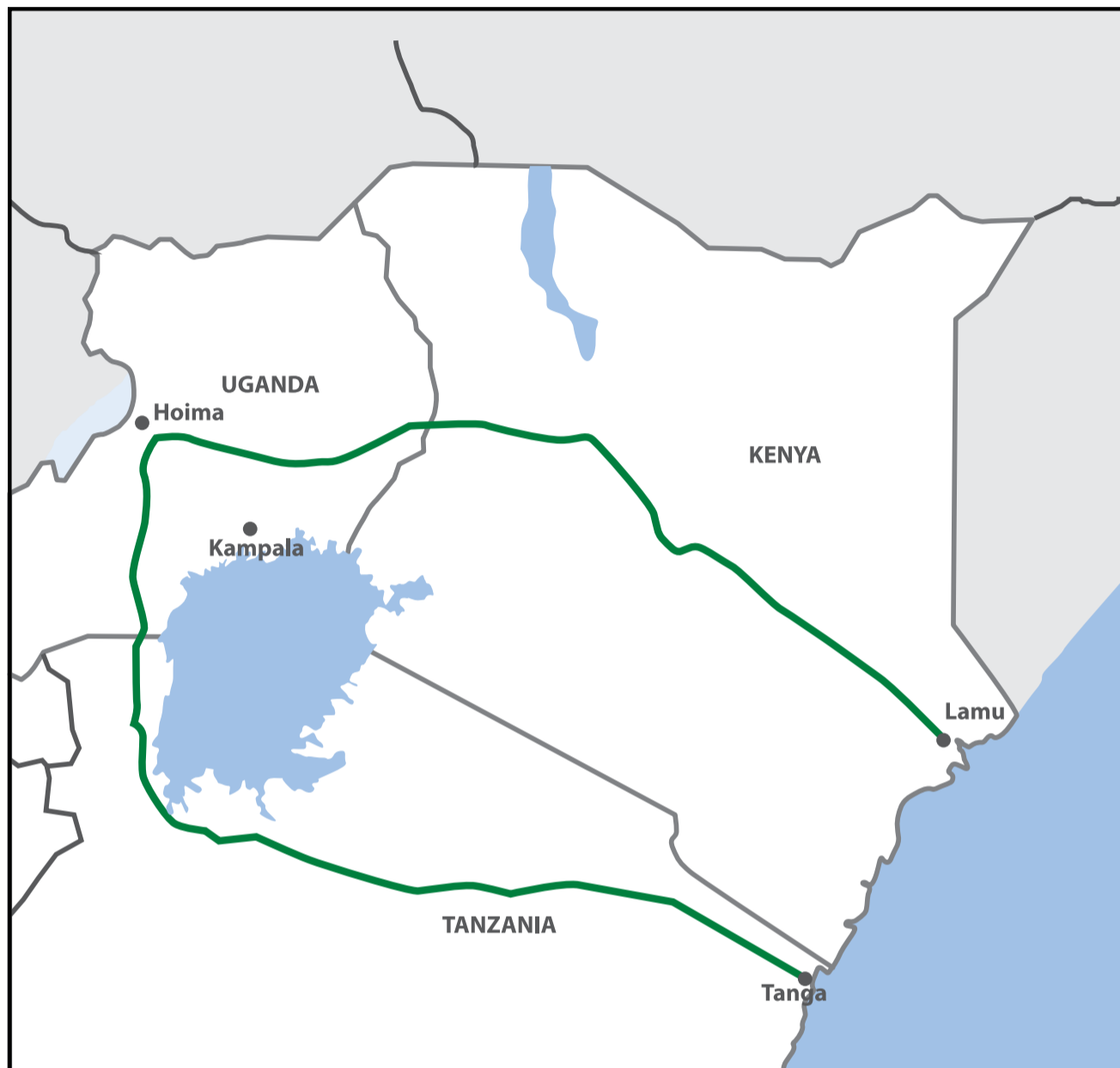
A graphic representation of the two pipeline routes from Hoima to the Indian Ocean