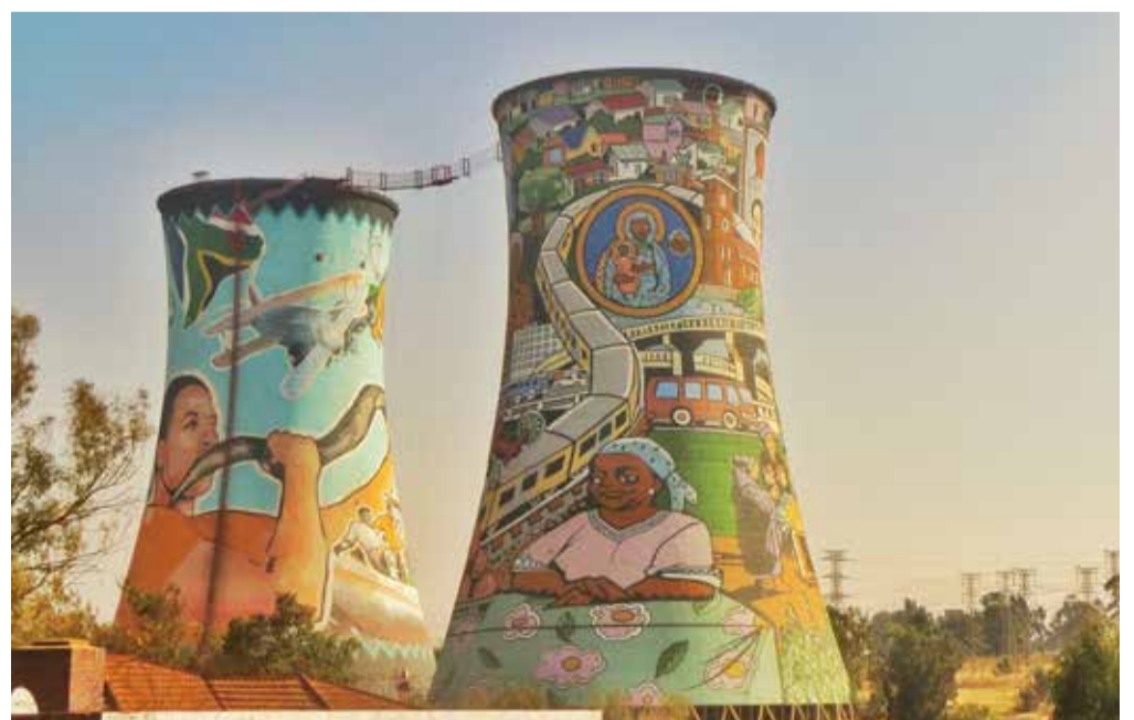
The Orlando Power Station cooling towers in Soweto, South Africa. The coal-fired power station was decommissioned in 1998 after 56 years of service. Unlike coal, nuclear energy remains a much cleaner source of fuel to date.