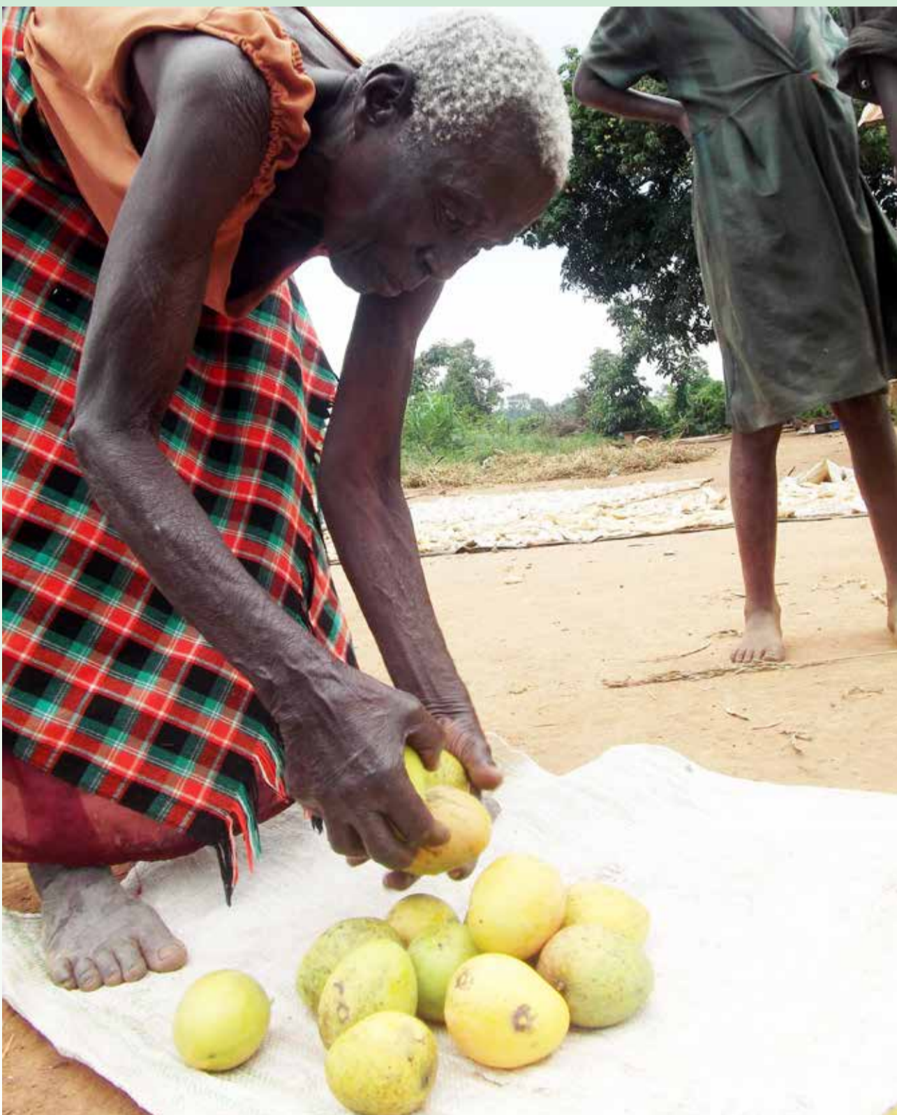
A woman sets up a roadside stall in Kigoroby, Hoima.

In the meantime, the farmers will bear the low prices offered by local traders as they wait for the oil camps to fill up again ■