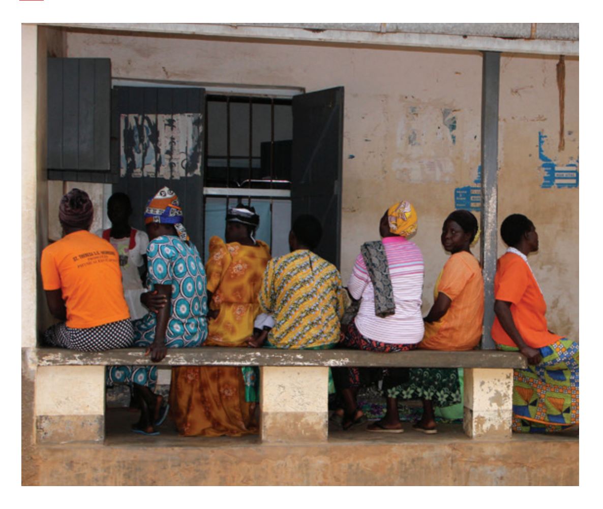
Patients wait for treatment at Pallisa Hospital