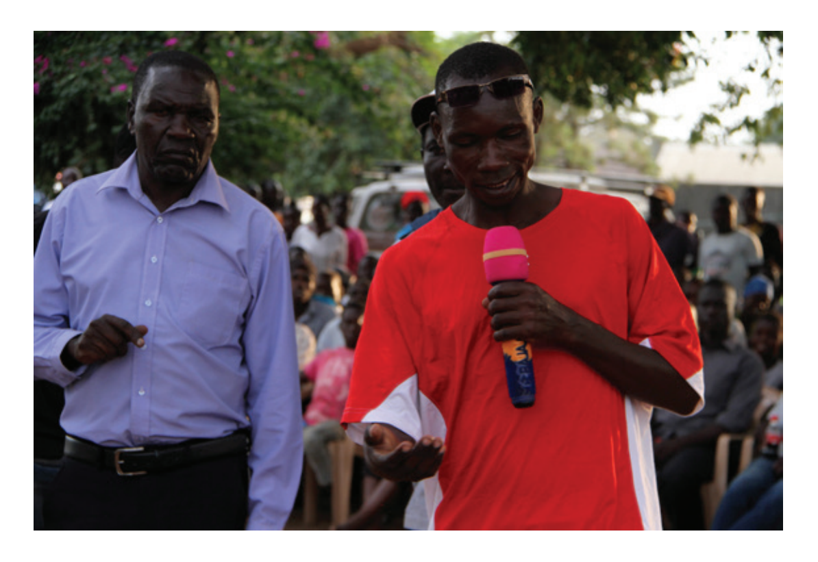
Residents speak out on corruption cases this was during the 5th leg of Anticorruption caravan stopover in Soroti district.