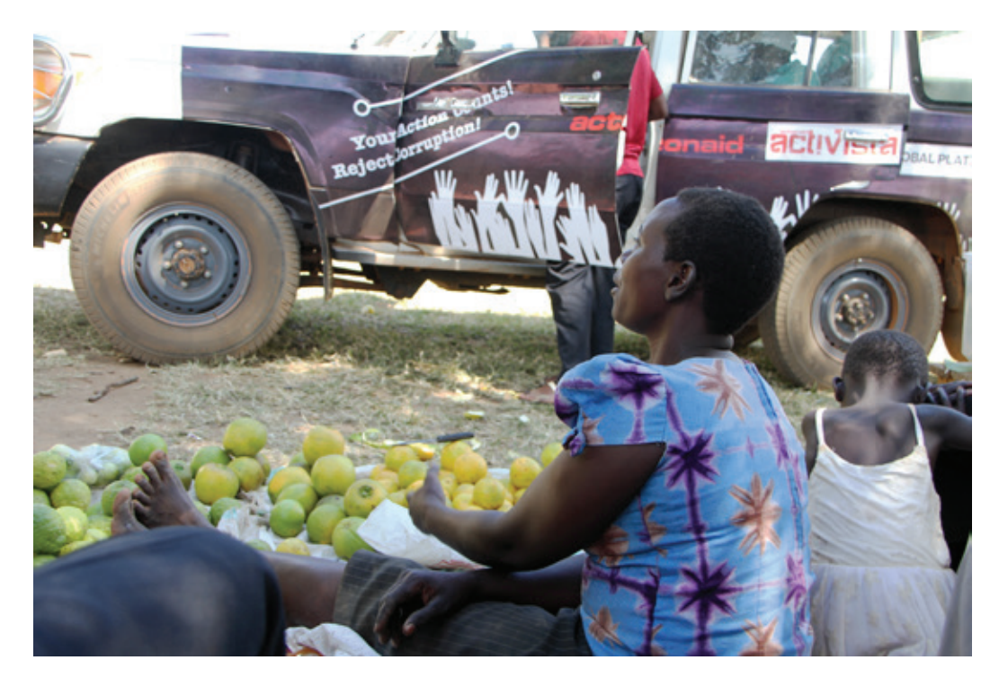
Resident selling oranges during the 5th legs of Anti-corruption caravan visit to Serere sub- County.