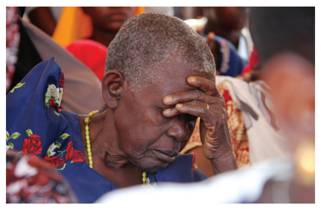
Residents attend the 5th legs of Anti-corruption caravan at Pallisa market.