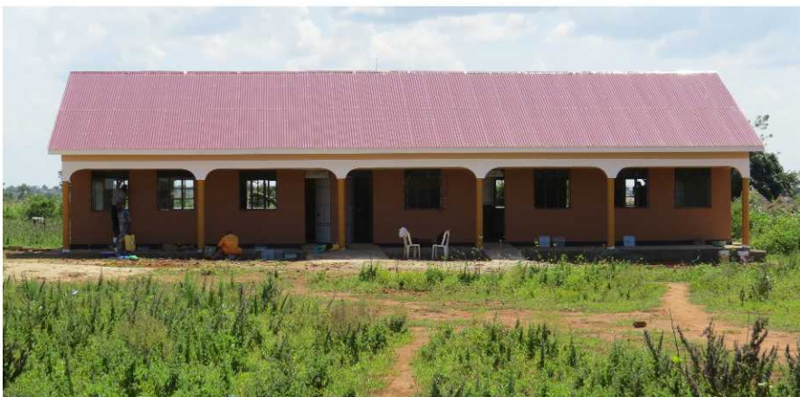
A newly constructed classroom block at the school

managed to write several reports to district and sub county. They also participated in school meetings with the parents and because of this; the parents are now very supportive in school activities. They have been the voice of the school at the district and sub county. Through their lobbying the district has been able to give us a new two classroom block. Getting this support has taken us nine years to have our voice heard but it was only possible when Activista came in’