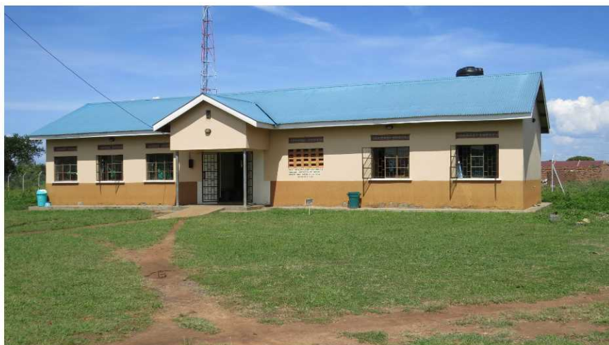
The constructed maternity ward at Nyero Health Centre II in Kumi District

On the relationship between health workers, Activista and the local community, she has this to say “Relationship between the community health workers and the monitors is good because we often interact and the dialogues have brought us together and \helped us identify gaps and we see to it that we work on them together. The health centre now is performing better than before – in the first score card we were at about 53% but the second score card gave us around 70 meaning that there has been an improvement”