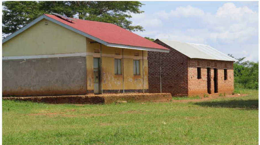
Some of the classes at Kanyanga Primary School

This year the school constructed one teacher’s house as a result of parents contribution from PTA. Due to the monitoring efforts of Activista they found that we were having challenges with the funds so they