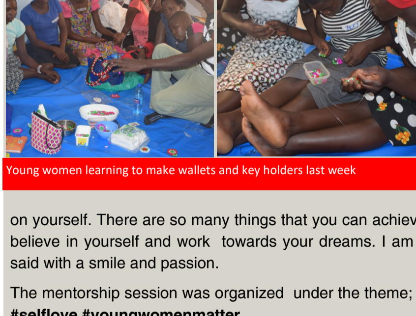
Young women learning to make wallets and key holders last week