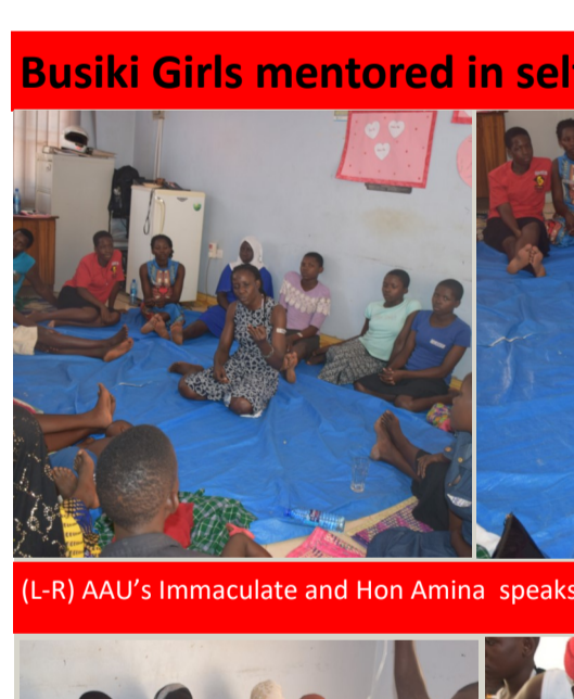
Students interacting with a person living positively at Tusitukirewamu