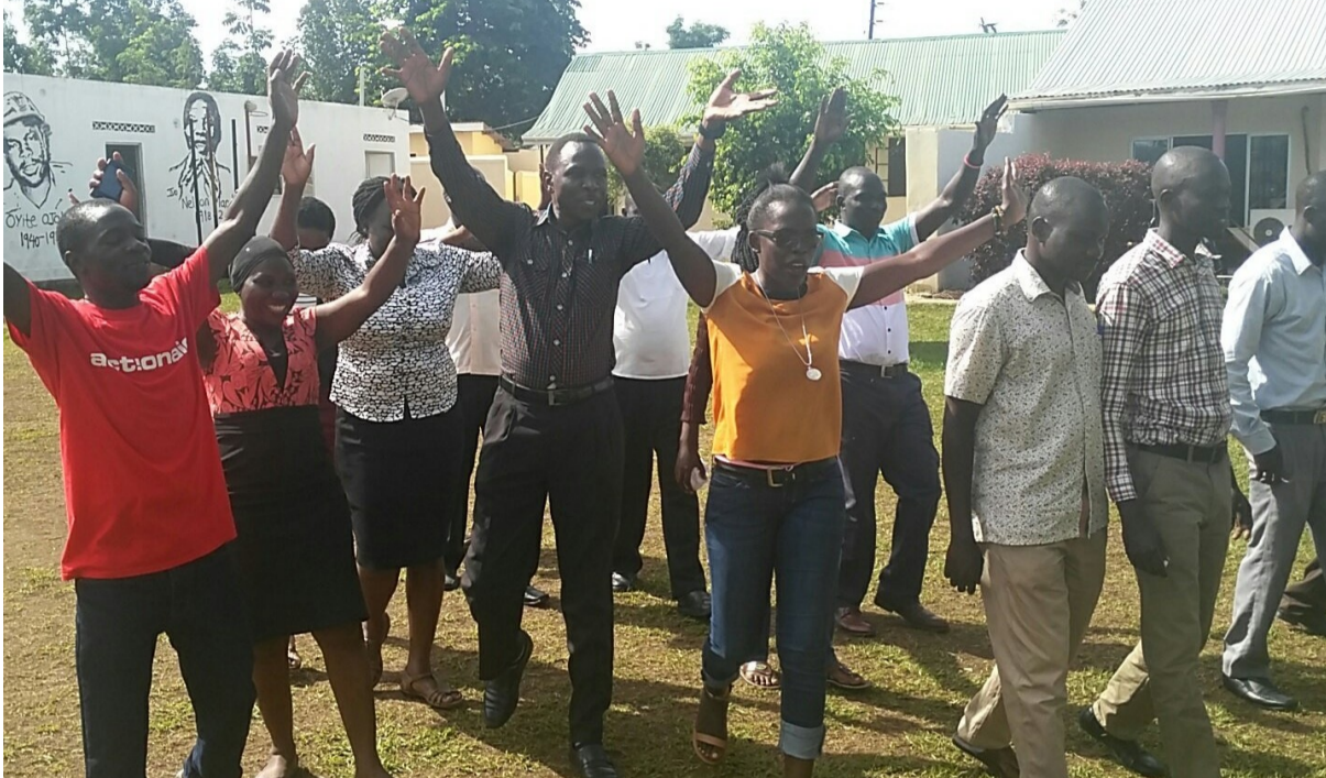
ActionAid staff in a role play of a non violent act at the social movements training last week in Lira.

ActionAid Uganda's 5 th Strategy; Strengthening Struggles for social justice outlines an intent to broaden organizational partnerships. It also states that the organisation will work with community groups, social movements, coalitions, networks of civil society organisations, cultural and religious institutions plus political parties to strengthen their capacity and the active agency of people living in poverty to claim and defend their rights. To achieve this, ActionAid is working to deepen staff understanding of social movements