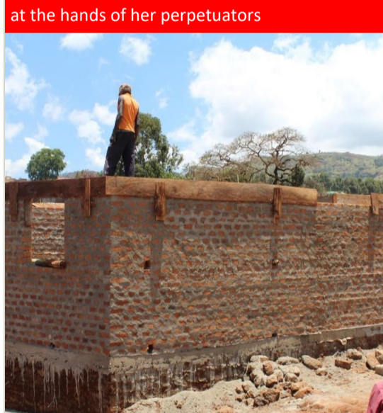
The house that her sons are constructing for her in her land