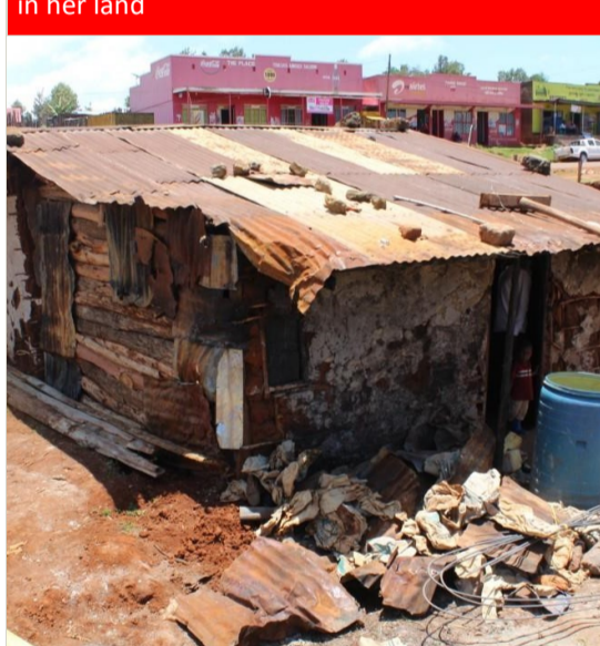
Her current house, which was donated by a good samaritan after her house was burned down