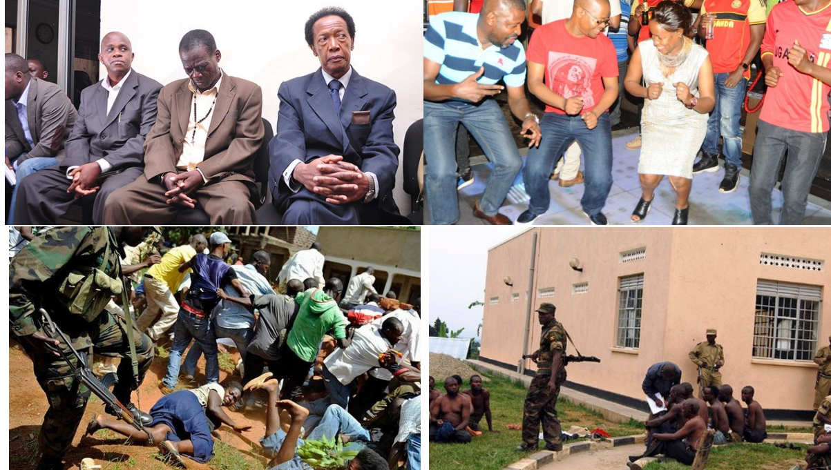
Left-Above: The CSO leaders commended the anti-corruption court for finding the three officials guilty of embezzling pensioners money. Right are some of the officials celebrating the Uganda Cranes qualification to the Africa Cup of nations. The qualification brought the country national pride.