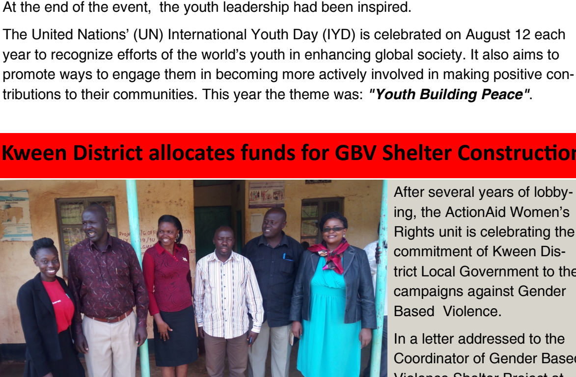
allocated funds are not enough to complete the construction of the shelter. Other districts that have allocated funds to the shelters include Gulu (UGX10000000). Currently, the GBV shelters are being funded by DFID until 2020.

shelter model in the district", she said.