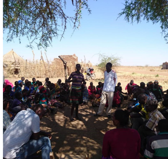
A youth explains the challenges that they face specifically in agriculture

Last week, the ActionAid livelihood unit supported Kotido district EU funded youth empowered (YESSEN) project team in their appraisal of youth climate change adaptation practices groups.