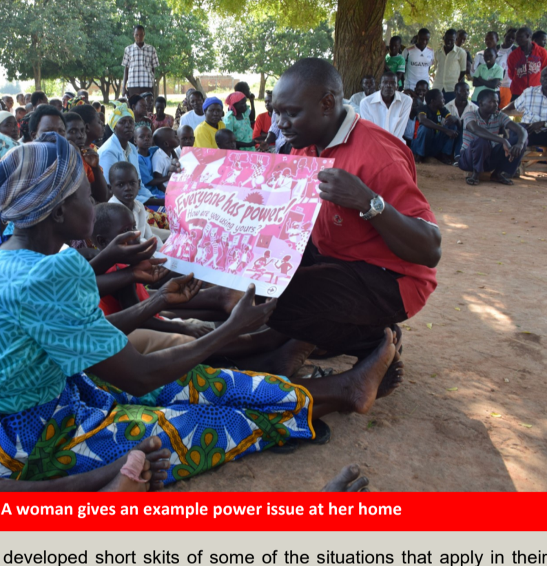
A woman gives an example power issue at her home