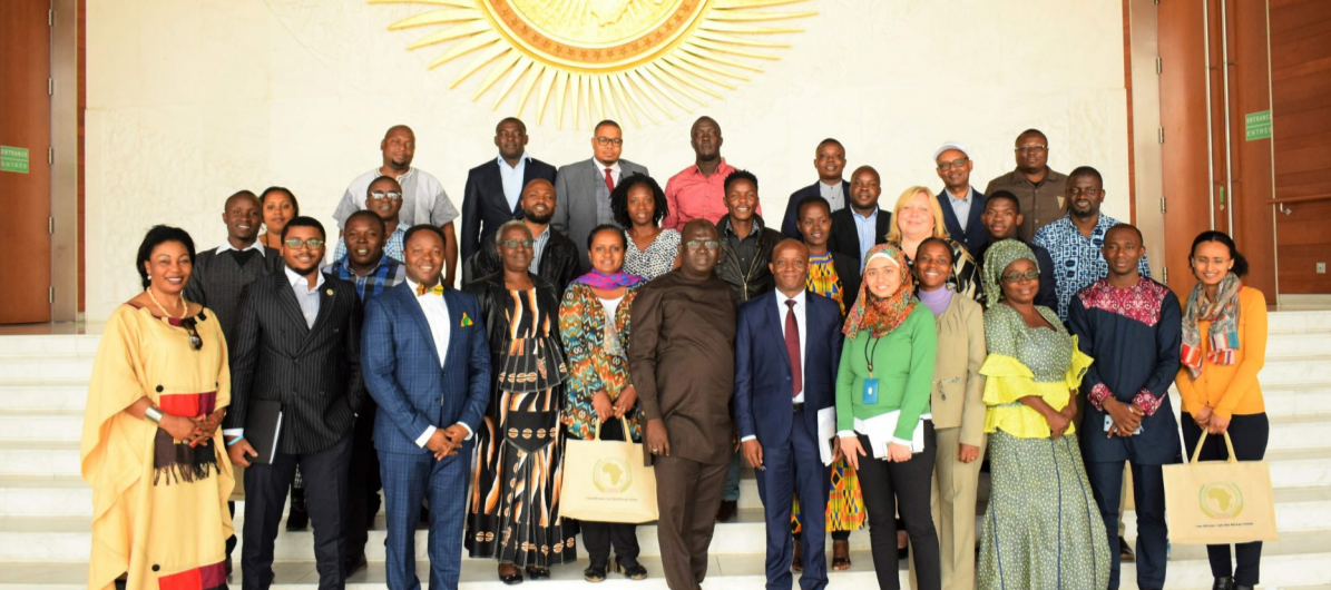
Delegation of Civil Society with officials of African Union Commission