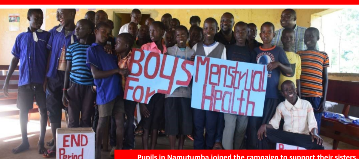
Pupils in Namutumba joined the campaign to support their sisters.