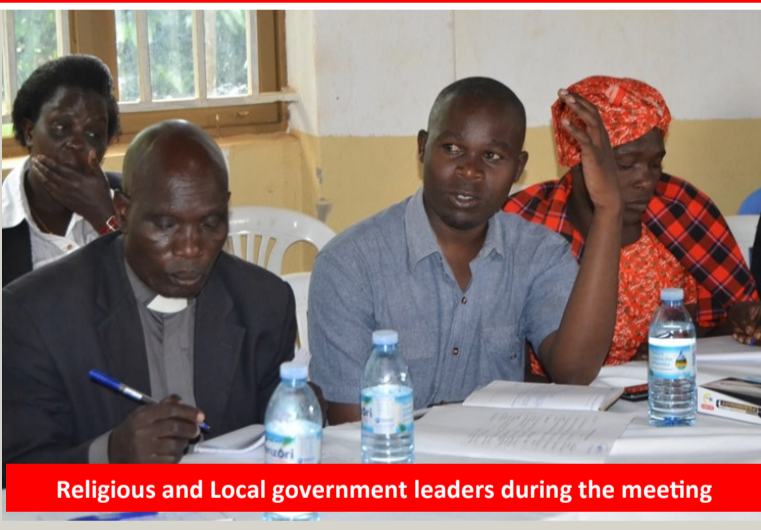
Religious and Local government leaders during the meeting