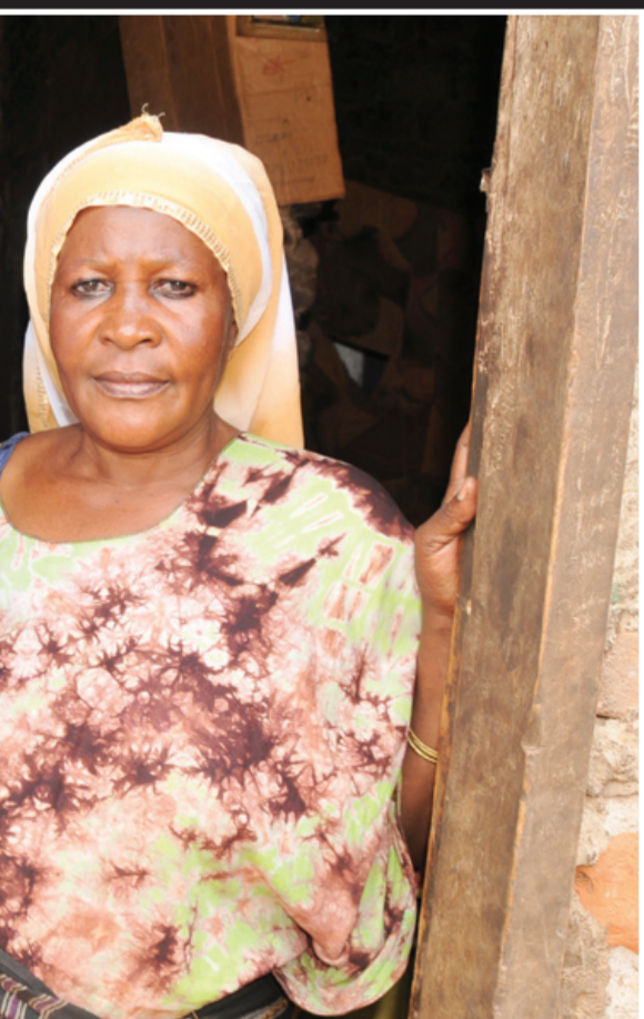
She dropped out last year after KCCA closed