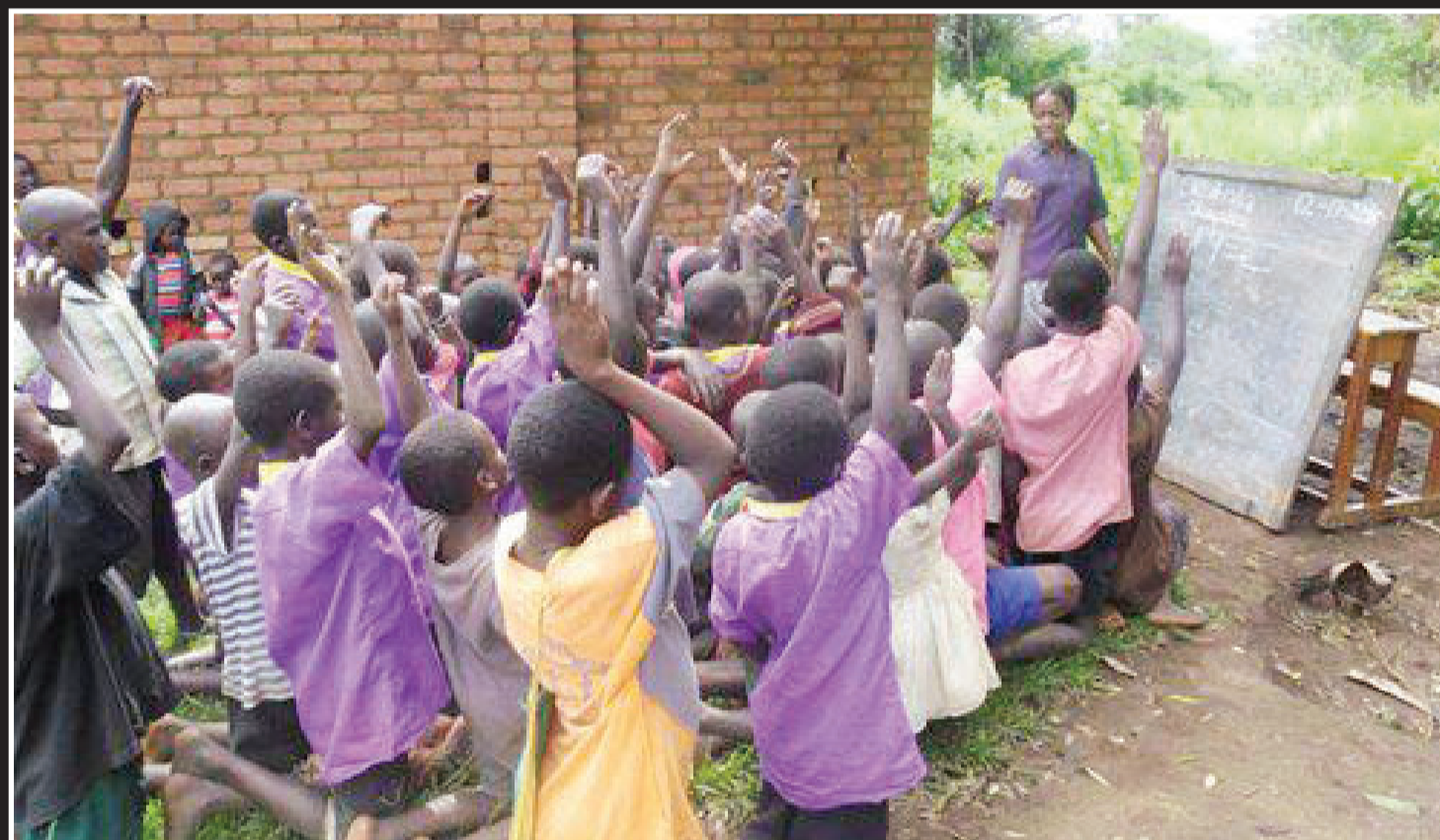
Children dont have classrooms. When it rains, the only option is to leave.