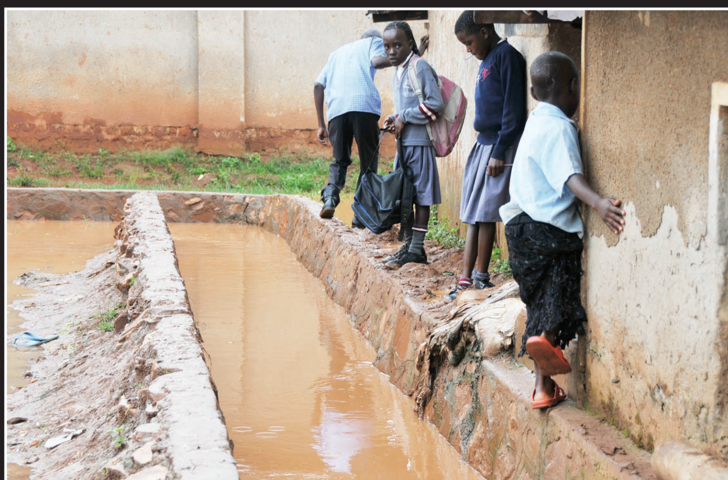
Pupils struggling to find a way to school in Bwaise after it rained heavily.