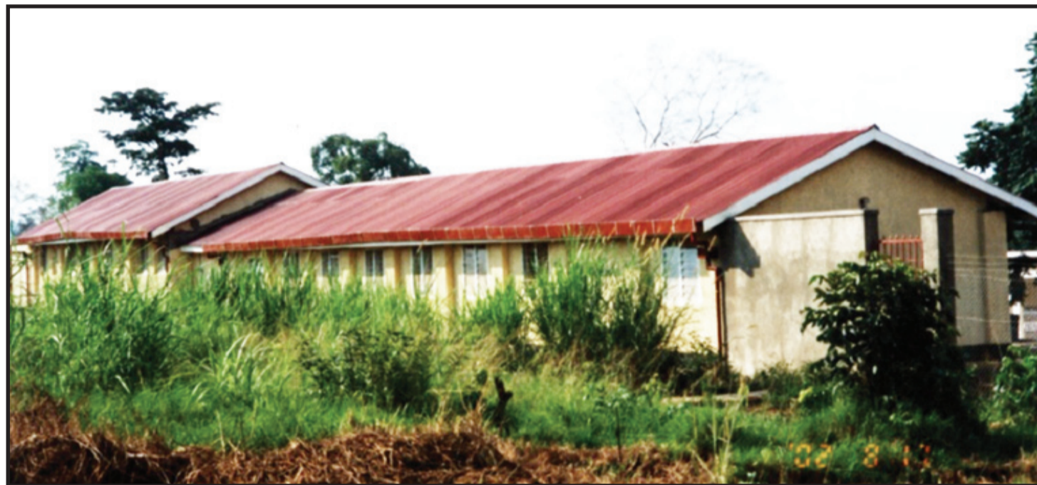
Former Kitemba Primary School which currently houses offices for Kaweeri Coffee plantation

IF THE INCUMBENT leaders of Uganda had attended the same UPE that they boldly list as an achievement, would any of them have had a chance at becoming half of what they are today?