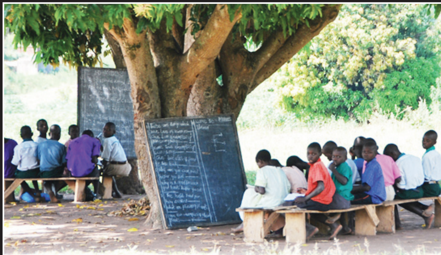
Pupils studying under a tree.