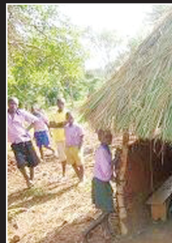
Its where they call classroom...

Our country state of ed Where is g ment's inv in education