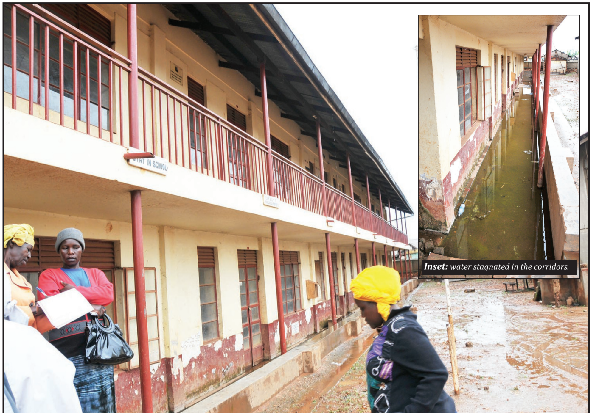
Inset: water stagnated in the corridors.