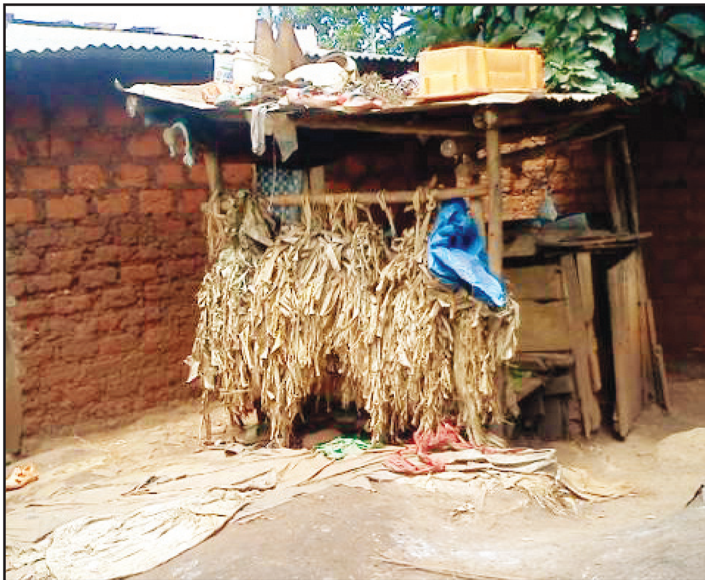
A kitchen of one of the teaching staff at Ntinda Police Barracks Primary School