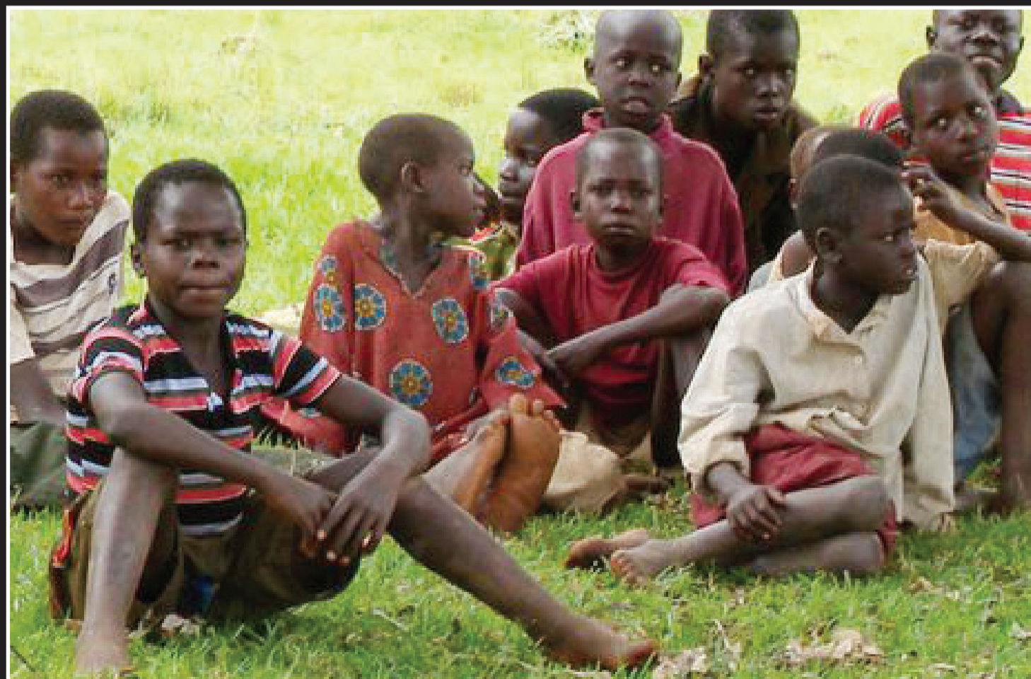
Their daily study depends on the day's weather.