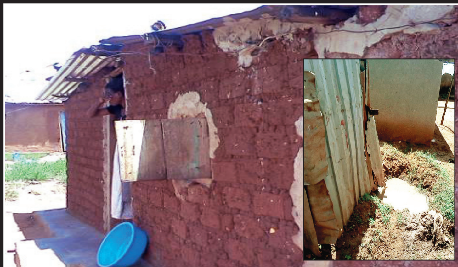
Ntinda Police Barracks Ps teaching staff quarters. Inset; the bathrooms.

Our country state of ed Where is g ment's inv in education