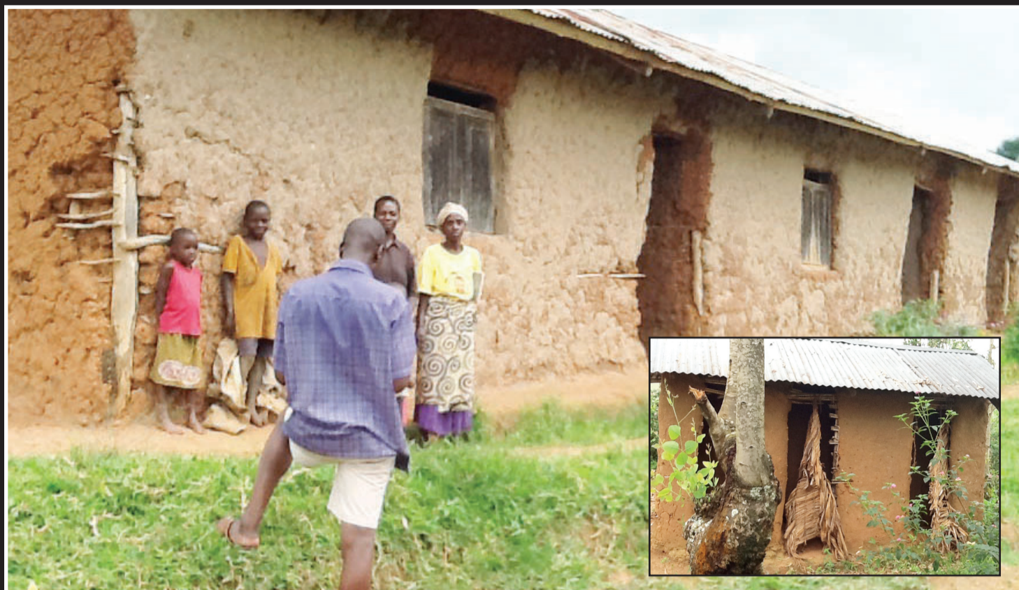
A classroom block at one of the upcountry primary schools. Inset are the latrines with no doors.