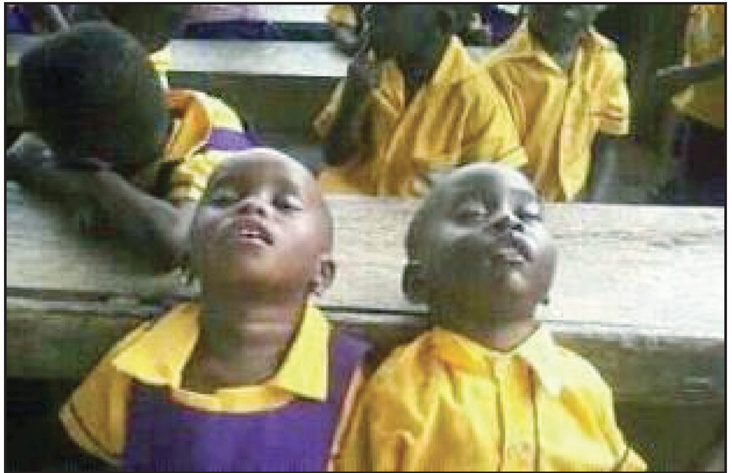
How much can a hungry child achieve?

The theft of public funds in the education sector touches every citizen. Children do not learn