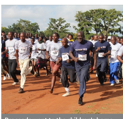
Proceeds went to the children's home

The chief runner was Hon. Musa Echeru, the Minister of State for Disaster Preparedness. Over six million UGX was raised from ticket sales of the marathon.