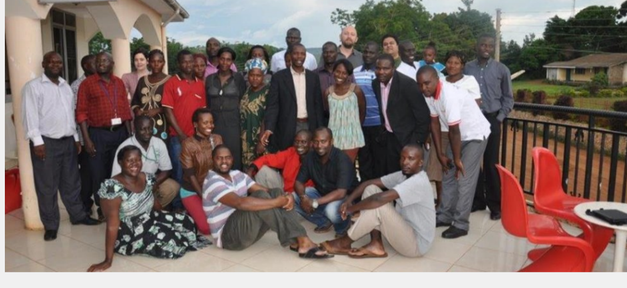
Participants of the Extractives Workshop in Hoima.

Land and Oil Project last week organised a capacity-building workshop for selected AAIU staff, implementing LRPs and project partners involved in the implementation of the project's objectives.