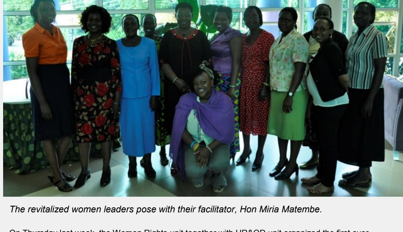
The revitalized women leaders pose with their facilitator, Hon Miria Matembe.

On Thursday last week, the Women Rights unit together with HR&OD unit organized the first ever Women leaders retreat. The purpose of the getaway was to provide space to the Women leaders to reflect on the challenges that they encounter as they pursue their career together with the motherhood roles. Celebrated women achievers such as Hon Victoria Sekitoleko and Hon Miria Matembe inspired the women leaders, challenging them to persevere, and strive to inspire before they retire.