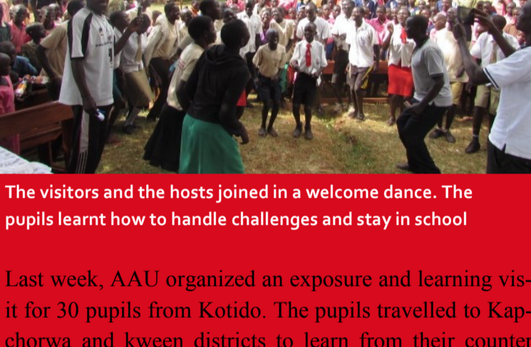
The visitors and the hosts joined in a welcome dance. The pupils learnt how to handle challenges and stay in school

Last week, AAU organized an exposure and learning visit for 30 pupils from Kotido. The pupils travelled to Kapchorwa and kween districts to learn from their counter parts how they have managed to stay in school and perform excellently in their studies despite the several challenges.