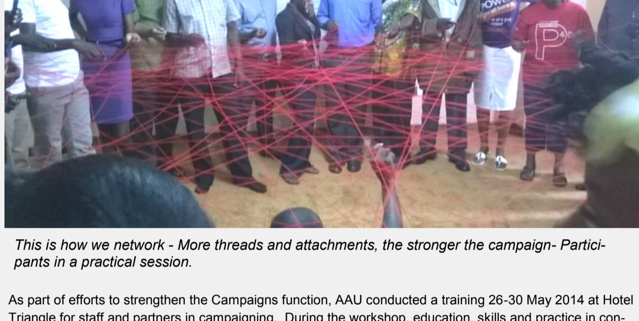
This is how we network - More threads and attachments, the stronger the campaign- Participants in a practical session.

As part of efforts to strengthen the Campaigns function, AAU conducted a training 26-30 May 2014 at Hotel Triangle for staff and partners in campaigning. During the workshop, education, skills and practice in conceptualisation, execution and evaluation of campaign issues was done in a very practical manner.