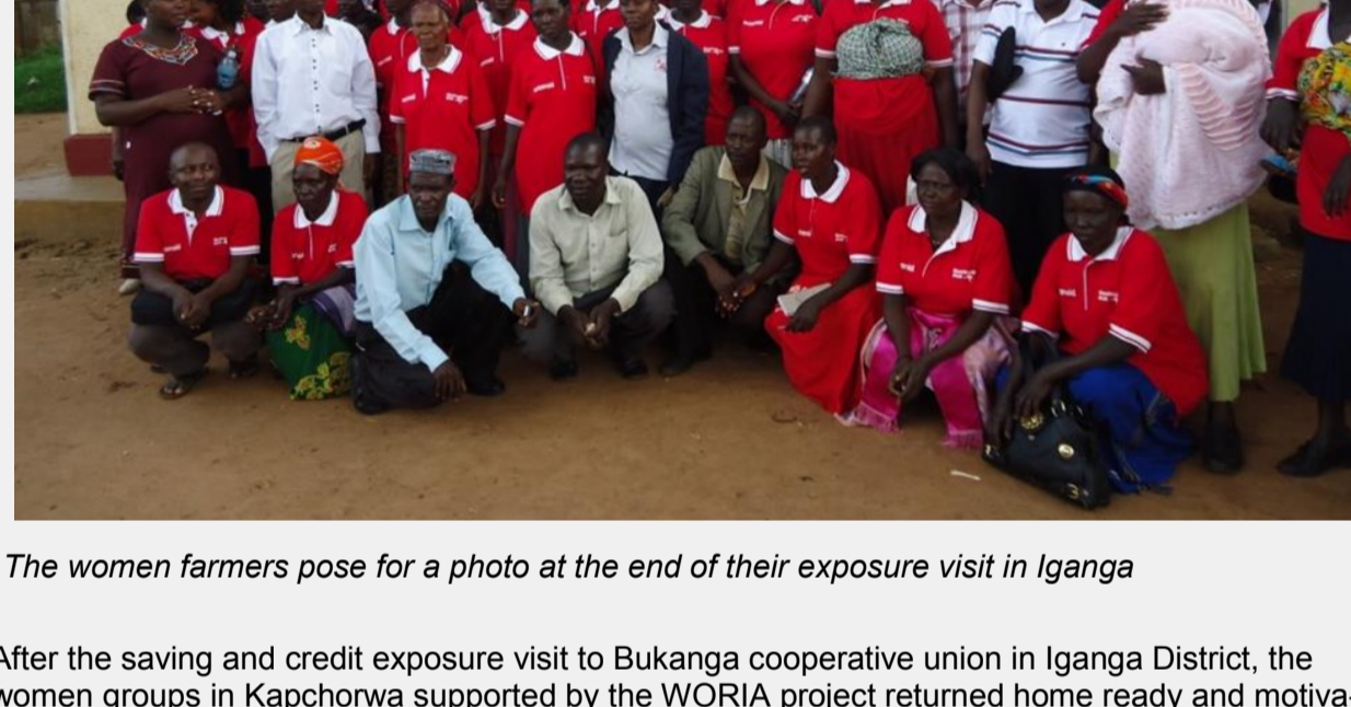
The women farmers pose for a photo at the end of their exposure visit in Iganga

After the saving and credit exposure visit to Bukanga cooperative union in Iganga District, the women groups in Kapchorwa supported by the WORIA project returned home ready and motivated to strengthen their cooperatives and improve their economic status. The two women groups of Kwosir and Kapteret have for the last two years been growing stronger. They have started a saving and credit Sacco to build on their financial base and eventually register as a cooperative.