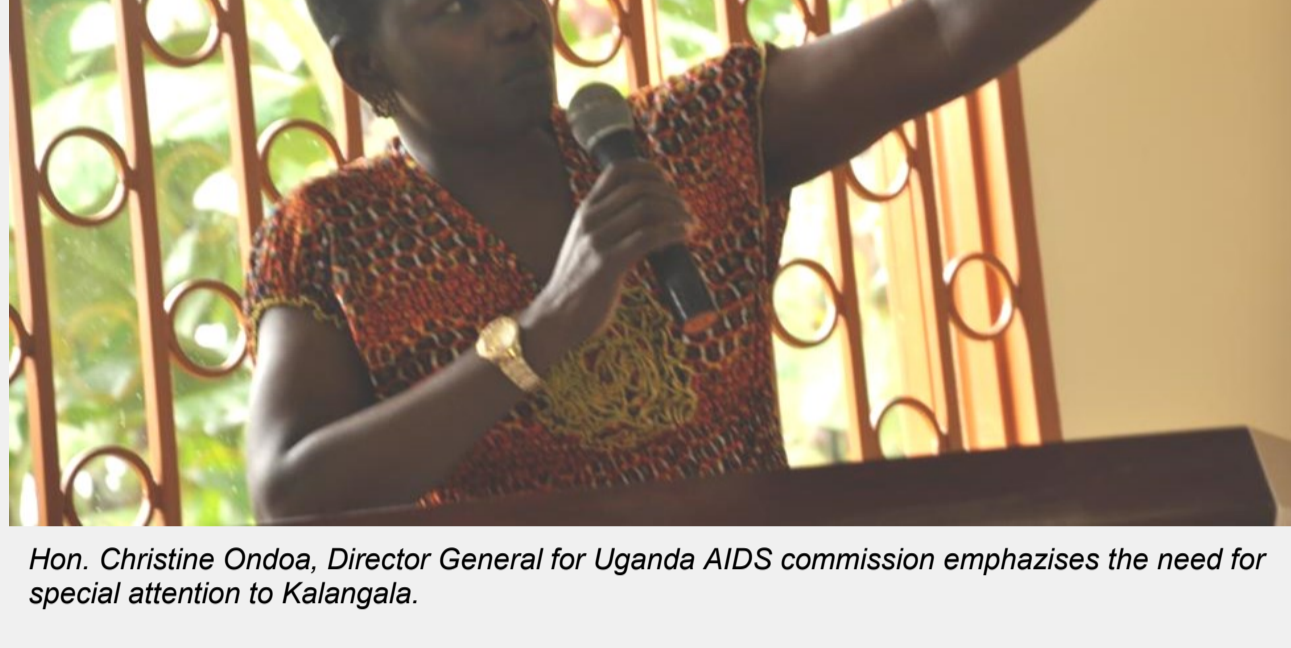
Hon. Christine Ondo, Director General for Uganda AIDS commission emphasizes the need for special attention to Kalangala.

Hon. Christine promised to do whatever it takes to ensure that the people of Kalangala are given priority, being that the district to date registers the highest HIV/AIDS prevalence (18-25%), a figure that is rumored to be the second in Africa.