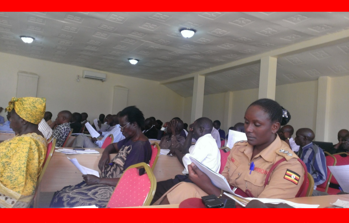
Participants closely examined documents and resolved to restore land tribunals to be supervised by the Magistrates

Stakeholders from the eight districts of Lango sub region convened last week, to discuss the most contentious issue that will ever be, Land. The meeting organized by ActionAid brought together all CSOs and actors that are handling land issues. These included the police, the Prisons, Magistrates and advocates, cultural leaders, politicians among others.