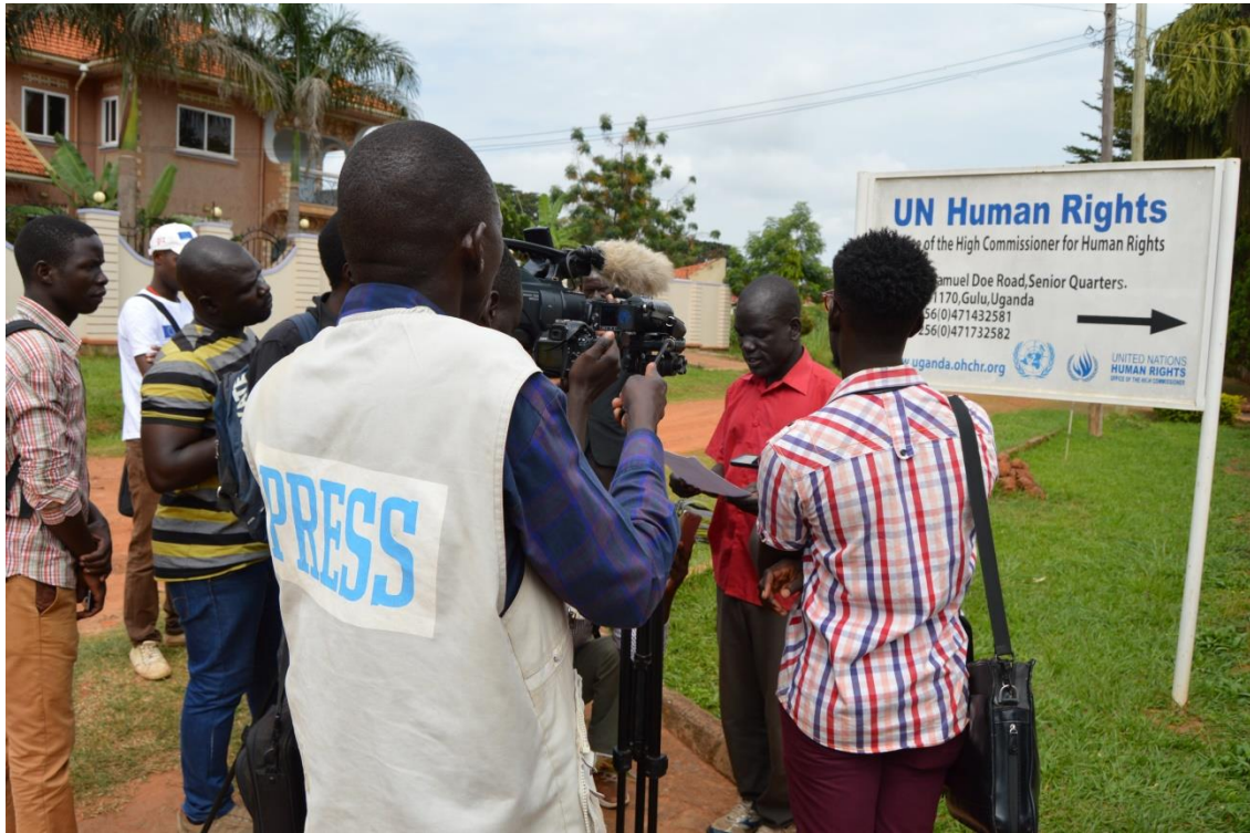
Journalists interview the Chairman of Apaa on day one of the peaceful demonstration at UNOHCHR