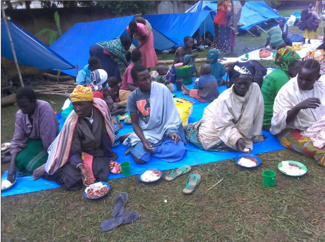
Over 200 Akaa community residents camped at the UNOHCR Gulu Office.

7 days at the UN offices, Akaa community awaits International Intervention!