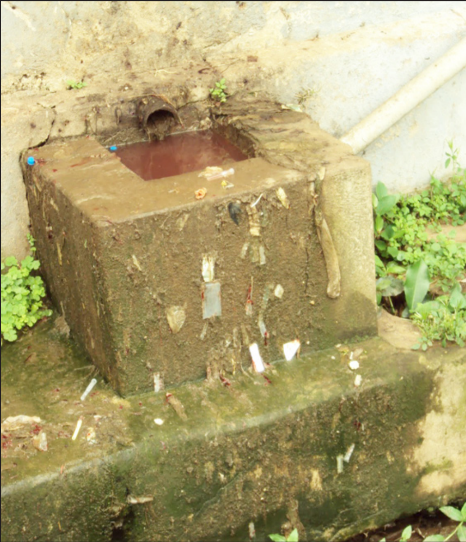
An over flowing sewer from the marternity theatre a breeding ground for deadly disease!