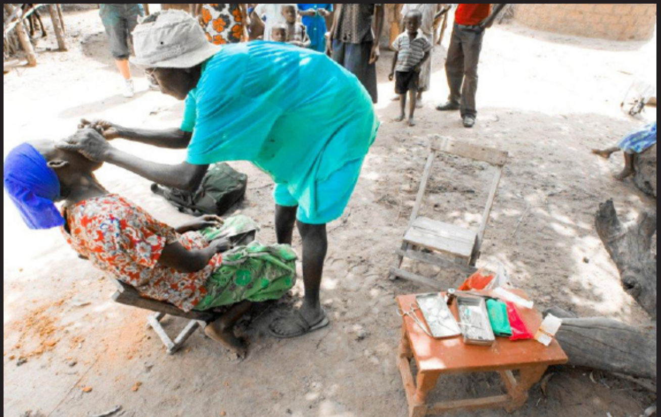
Patients wait for local dental services in Katakwi

6/ Appreciating the role of the Police in the Black Monday Campaign