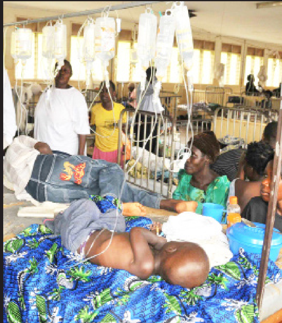
Kawolo hospital emergency ward, a death trap!