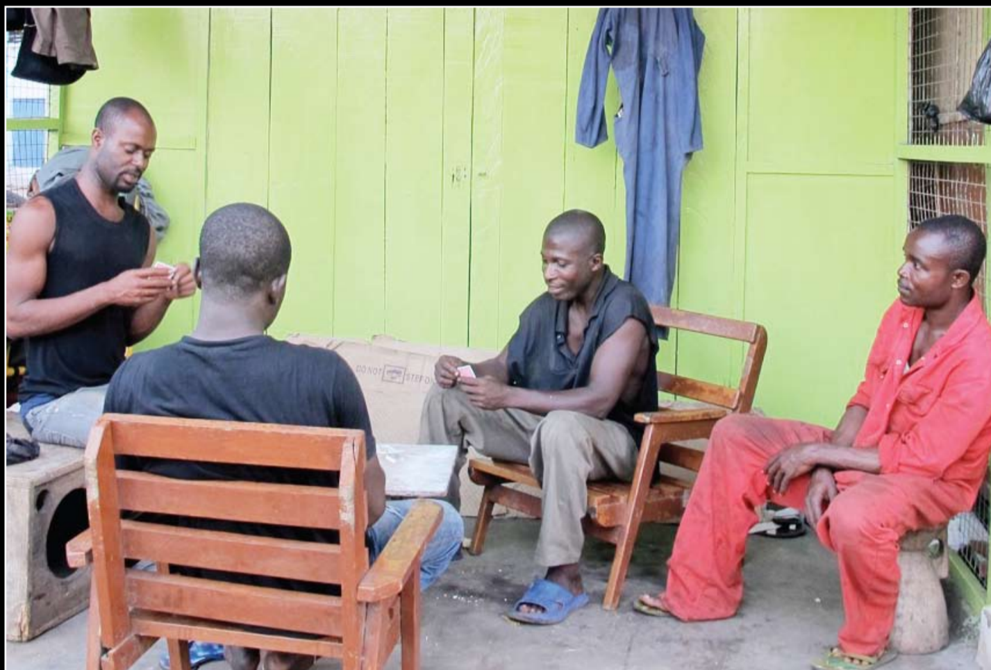
WHERE IS THE HOPE FOR THE UGANDAN YOUTH? The high level of youth unemployment has left many heading for gambling and other unprofitable schemes of work.

The high level of unemployment among the youth is a global concern as it is a recipe for organized crime, lawlessness, political instability and social conflicts. The Government of Uganda has in the past undertaken a number of programs intended to address the problem of un-employment and poverty among the youth including: Northern Uganda Social Action Plan (NUSAF 2), Skilling Uganda, Youth Enterprise scheme, Youth Venture Capital Fund, and the latest one being the youth livelihoods programme. It is important to note that around 78% percent of Uganda's population is under the age of 30 years. In this edition, we meet a Ugandan youth as he narrates his story of growing up, and the challenges other youth in his age group faced