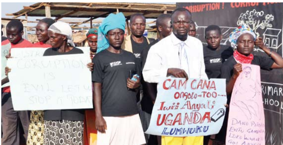
Youth in Amuru district stand up against corruption during the 2013 anti corruption caravan.

“We started by organizing several community meetings to map out the exact issues. We discussed with the ActionAid partner, Partner for Community Development (PCD)