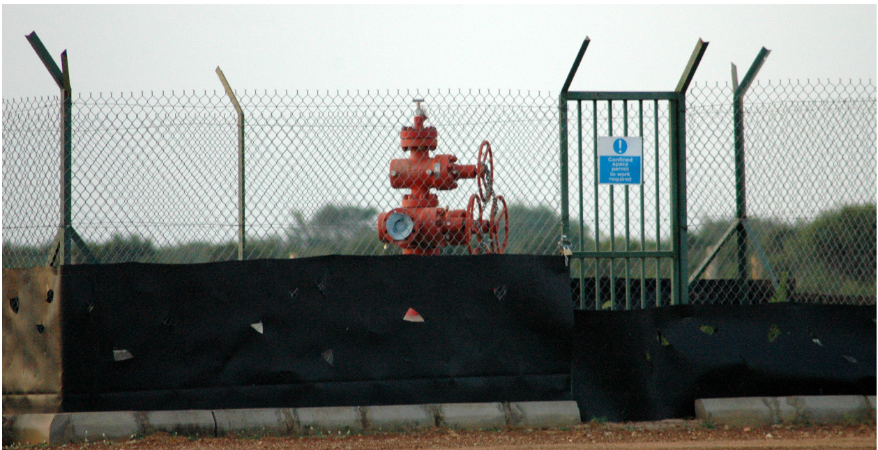
A fenced oil site in Buliisa District (Oil in Uganda, 2012)

Human rights impacts and responsibilities differ across industries, and the services a company is providing. A financial inspection service has a duty to abide by anti-corruption laws, meanwhile oilfield, engineering and infrastructure services can impact on the environment.