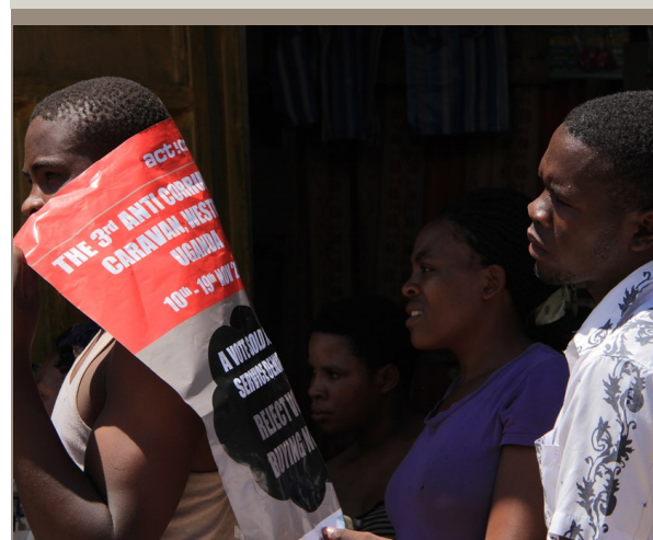
The youths take off time to understand the anti-voter bribery message in Kasese yesterday.

Residents in Kasese district have blamed food shortages and abject poverty levels on the rampant corruption tendencies that affect service delivery in the area.