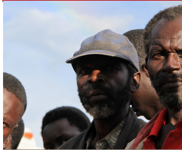
The senior citizens called for the prosecution of all thieves of votes and public funds.