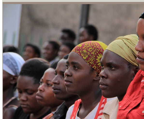
The women's call across the region is one, investment in maternal health.