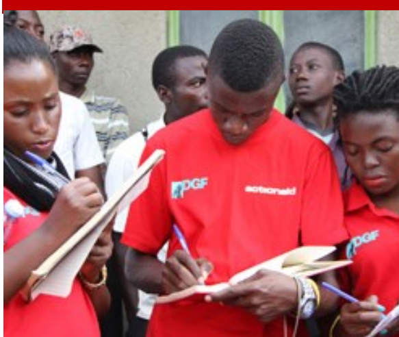
Part of the caravan crew documents cases of voter bribery in Rubirizi yesterday.

While at the caravan rally, the women decried