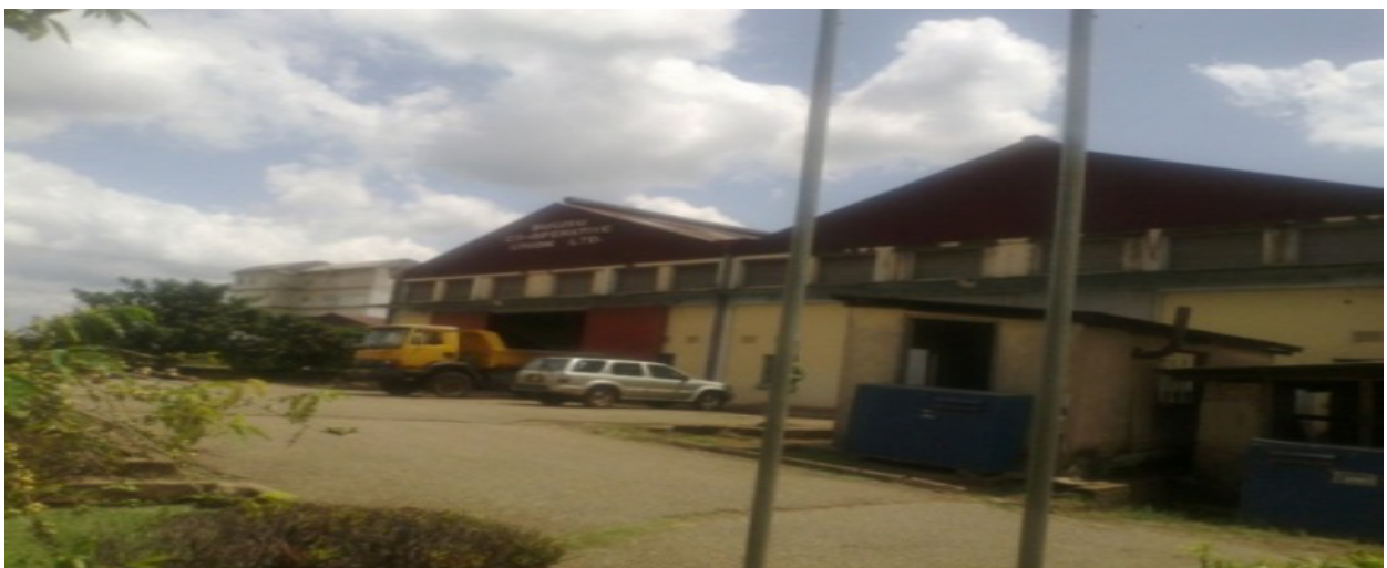
Figure 2: Bugisu Cooperative Union, Mbale

Bunyoro Cooperative Union which is now barely function used to fabricate spare parts for its primary cooperative members and unions in other parts of the country. According to management, the technology was old and they did not have sufficient money to replace it. Previously, they fabricated spare parts for coffee factories and even tractors. Just like the buildings, the technical skills of the cooperators must have steadily decomposing due to underemployment. Even in the best-case scenario, like that of Bugisu Cooperative Union, which owned a lot of relatively well managed real estate in Mbale Town, the offices and facilities at the factory left much to be desired as captured in Figure 2 below. If the Bugisu Cooperative Union is not attended to in time, it risks becoming another debris like the Teso Cooperative Union as reported in the New Vision Newspaper (see Figure 3).