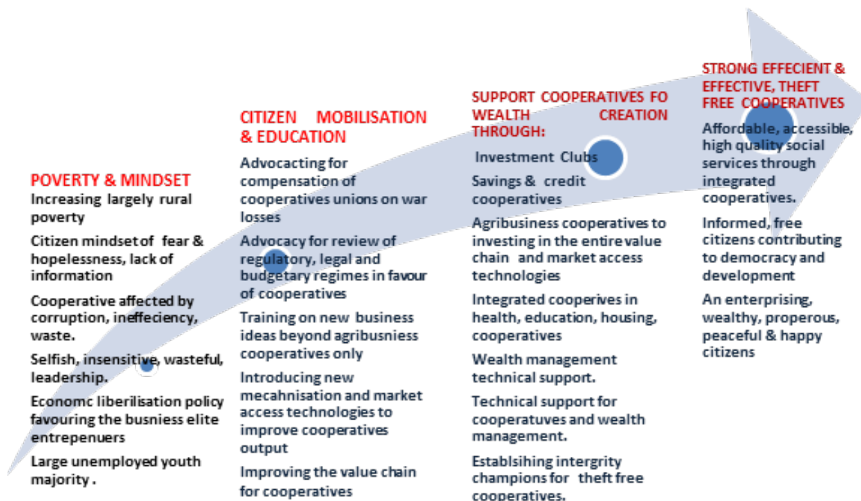
Figure 6: The theory of change for citizens welfare, vitality and wealth creation

Such programmes would need to benefit from adopting cooperative principles like: member owned, member controlled, member used and member benefiting to best operate in local context of Uganda. By their very nature and when managed well, cooperatives are the most clear citizen spaces for democratic practice and good governance. Organised citizens that are creating wealth will pay tax and therefore have a stake in the national democratic and development agenda. Such would create a healthy, productive, enterprising and wealthy population which is a necessary prerequisite for a united, peaceful and happy nation.