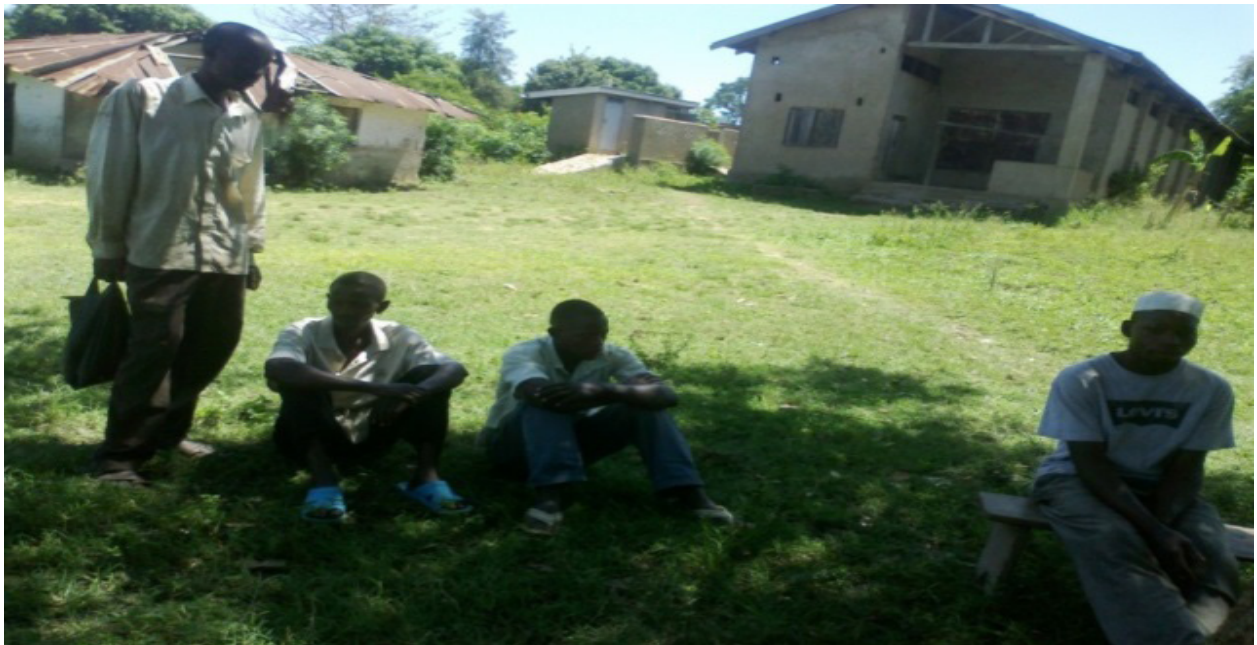
Figure 4: Kaiti Cooperative Society structures