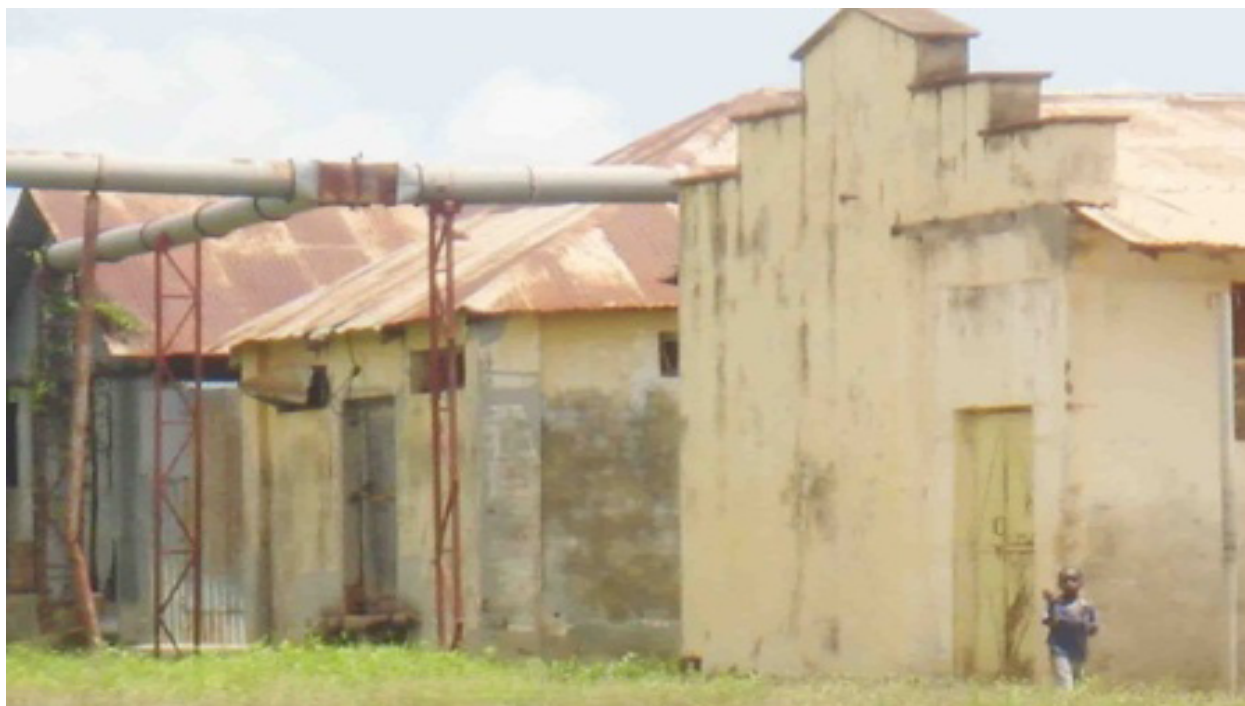
Figure 3: Teso Cooperative Union

Source: The New Vision , 20 th March 2013.