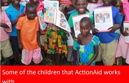
P4C Volunteers with some of the pupils after the Child protection Policy sharing session.

Last week, Stakeholders in the ActionAid Pallisa Cluster applauded ActionAid for its significant commitment to put an end to child abuse. During the Sponsorship Child pre- message collection meeting, the ActionAid team took off time to introduce the new child protection policy and declare the organisational commitment and compliance to the document.