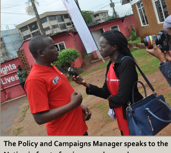
Nation in front of voice recorders and cameras