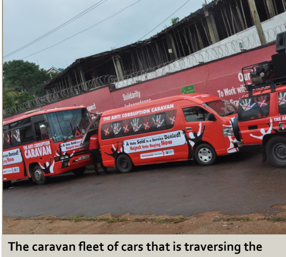
western region of the country. Its in Kabaale today.

izing a series of Anti-Corruption Caravans since 2013 when the first leg was officially launched in Luwero. It was followed by the second leg that took place in August last year and covered 15 districts in the North East and Eastern Uganda. These focused on unveiling the extent and impact of the corrup-