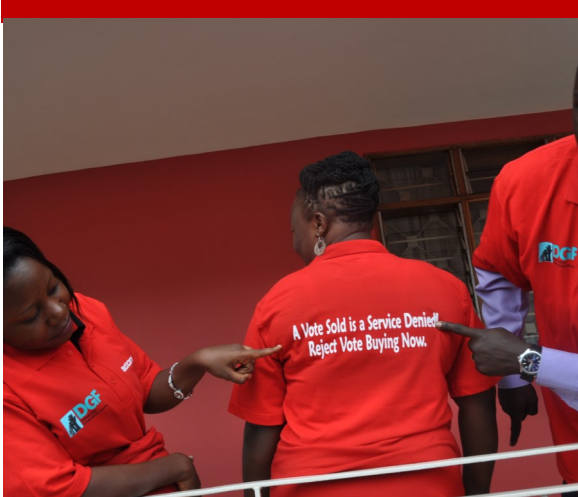
AAU staff say: A vote sold is a service denied. Reject Vote buying Now

Yesterday, ActionAid with support from the Democratic Governance Facility flagged off the western Leg of the anti-corruption Caravan. The theme for this year's caravan is; A voice sold is a service Denied! Reject Vote buying now.