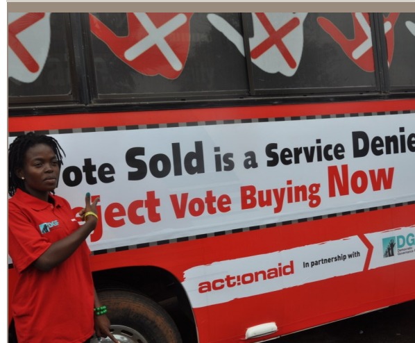
The message remains simple, clear and to the point. A vote sold is a service denied. Reject Vote buying Now