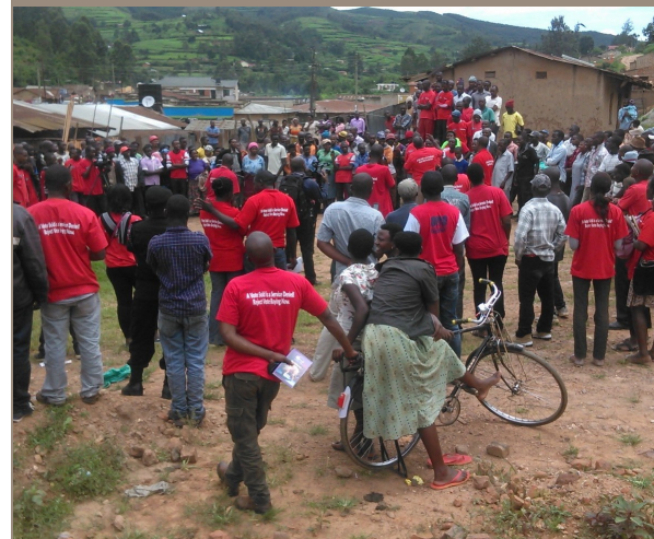
Part of the residents of Muhanga Trading center who turned up to join the caravan and denounce voter bribery