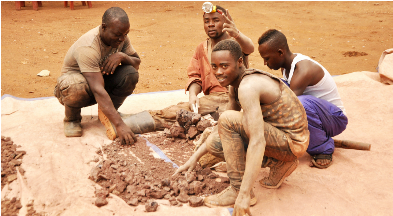
Artisanal miners separating Gold bearing material in the Mubende Gold mine.