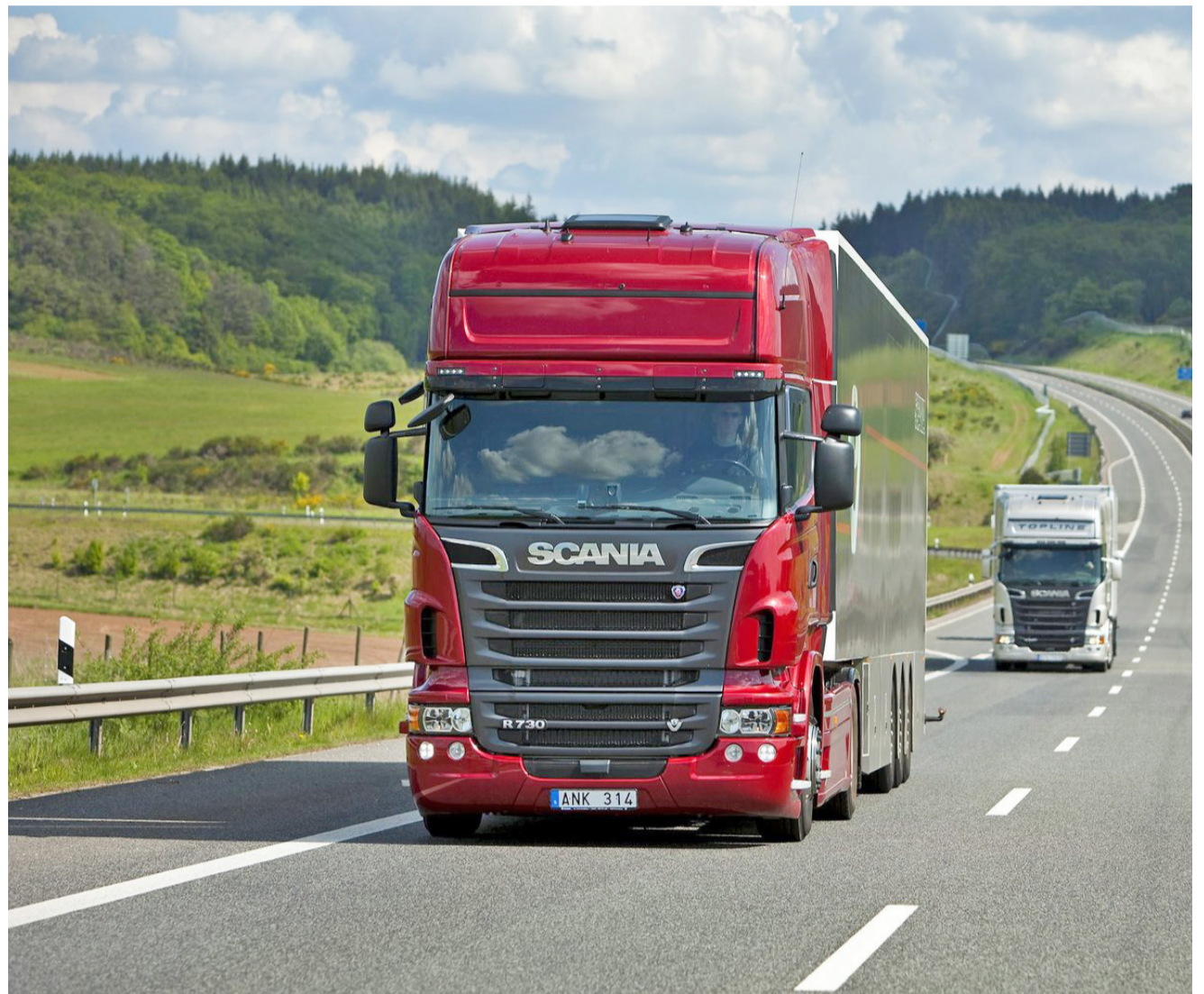
This is a depiction of the type of infrastructure and transport system that will be required.

“For equipment and materials that will pass through the port of Mombasa, the JVP intend to use the northern route and avoid the busy towns, because of