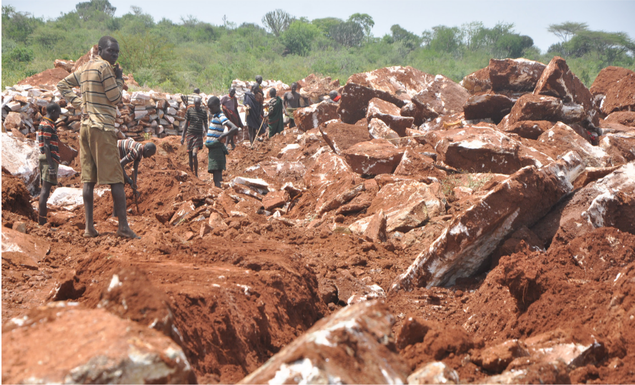
Locals crushing limestones to ready them for buying by Tororo Cement Factory in Kitikitile Parish, Tapac Sub county, Moroto district