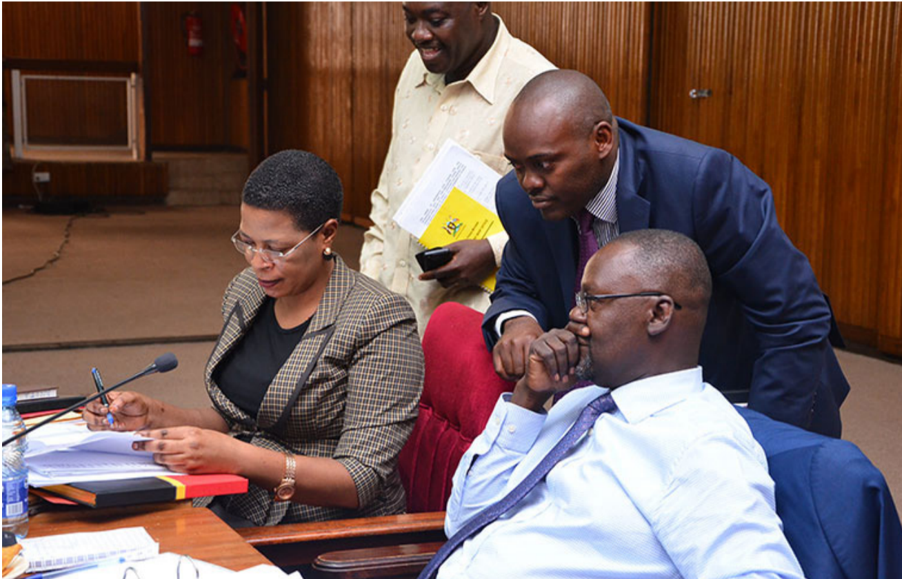
Members of the Parliamentary Probe Committee on the Shs. 6b presidential handshake. The mining sector has also got its own share of corruption related scandals that will probably require to be probed as well.

By Diana Taremwa, Water Governance Institute