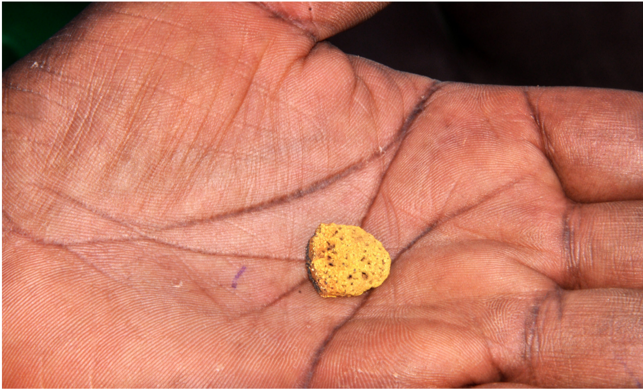
A gold nugget after successful amalgamation using mercury in Kampala gold mines, Mubende.