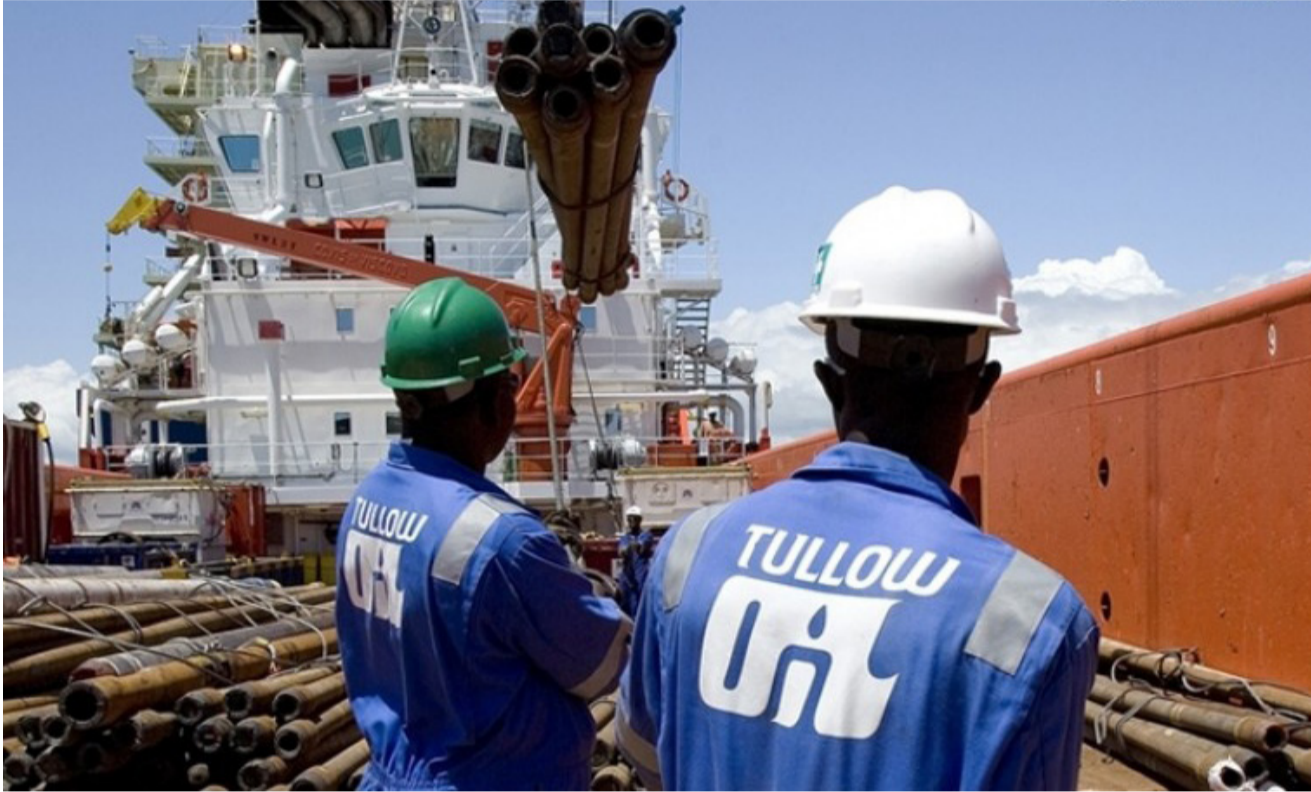
An Oil rig operated by Tullow Oil