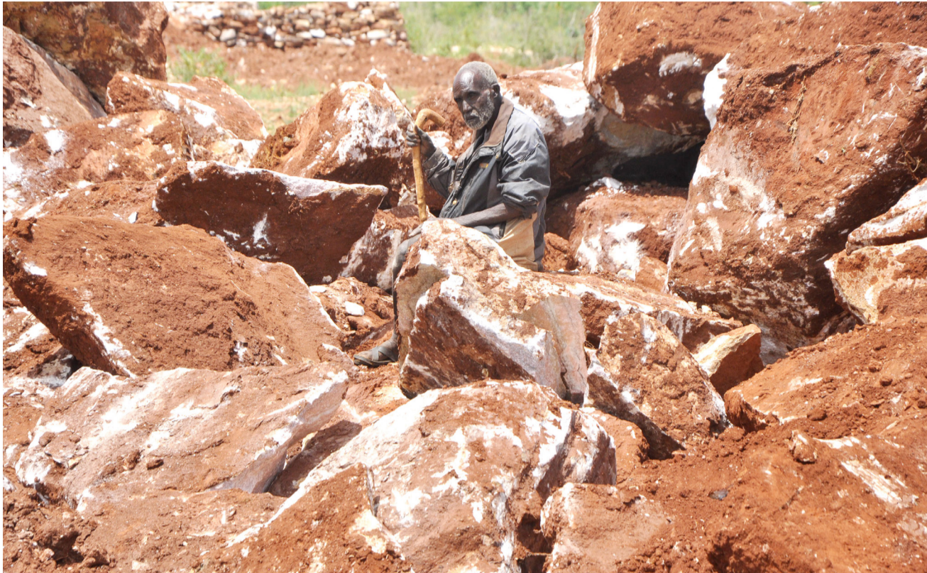
An elderly man protects his consignment of marble rocks in a mining site, located in Katikitile Parish, Tapac Sub County, Moroto district