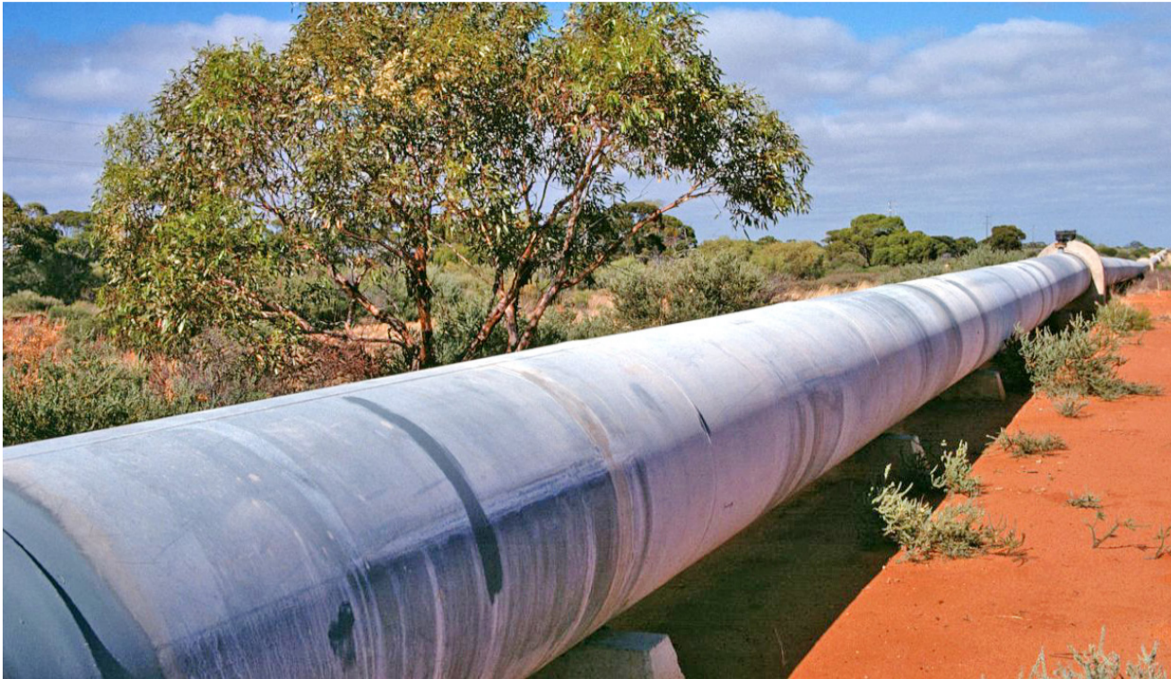
An overground oil pipeline but the planned East Africa's crude oil pipeline will be buried underground .