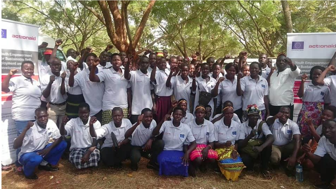
Young farmers from YESSSEN project enjoy a photo moment at the 2018 Agricultural show in Jinja.