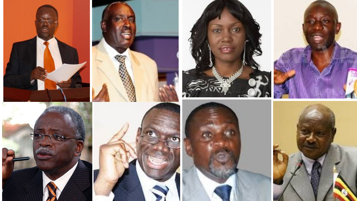
claiming that debates are for high school students, the rest battled out, exposing their intelligence, dreams for Uganda but also some drama. ActionAid joined the rest of the Ugandans last Friday to watch the presidential debate, a

Uganda's first ever presidential debate brought to the fore intelligent ideas for the country especially