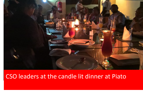
CSO leaders at the candle lit dinner at Piato