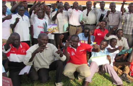
The team commit to end GBV in the community after the training.