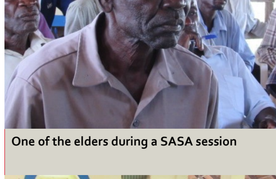
One of the elders during a SASA session

ActionAid Katakwi LRP has expressed worry over the increase in the number of GBV cases reported at the Gender Violence Shelter every week. More unfortunate is the Police and Courts delay in disposing off these gender related violence cases.