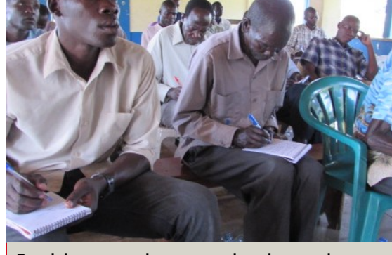
Participants took notes on legal procedures and the referral pathway

The meeting ended with a commitment by the participants to exhibit fairness while handling GBV cases, but more importantly to work hard to ensure that the incidents of GBV reduce in Katakwi district.