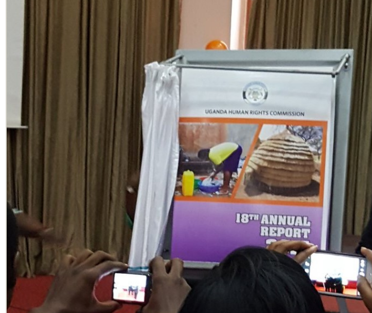
The Uganda Human Rights commission report fingered the police on the abuses of Human Rights. Unfortunately, the Police Spokes person could not comment on the report. He instead asked for more time to scrutinize the report.

For the 10 th year in a row, the police have been pin-pointed as the leading abuser of human rights in the country by the government agency charged with tracking rights’ violations.