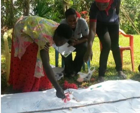
Participants testing the tools with community members.