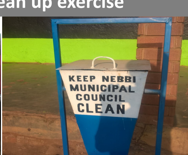
(Left) Leaders from Nebbi join in the cleaning exercise in preparation to usher in the municipal status. Right is one of the rubbish bins that were put in place to ensure a clean municipality.

ActionAid together with other civil societies in Nebbi took to the streets to clean up the town council. Nebbi will officially become a Municipality by the end of this month and the cleaning was one of the activities meant to set ground for the celebrations.