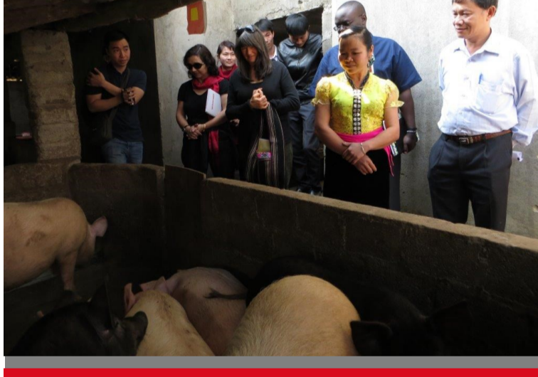
Our CD and other Review Team Members at a visit to a Livelihoods Project by AAV