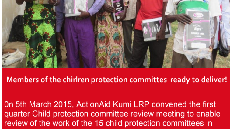
Members of the children protection committees ready to deliver!

On 5th March 2015, ActionAid Kumi LRP convened the first quarterly Child protection committee review meeting to enable review of the work of the 15 child protection committees in Ongino, Malera and Kidongole sub counties. The half day meeting which was held in the Kumi GBV shelter was attended by chairpersons of the different parish-based Child Protection committees.