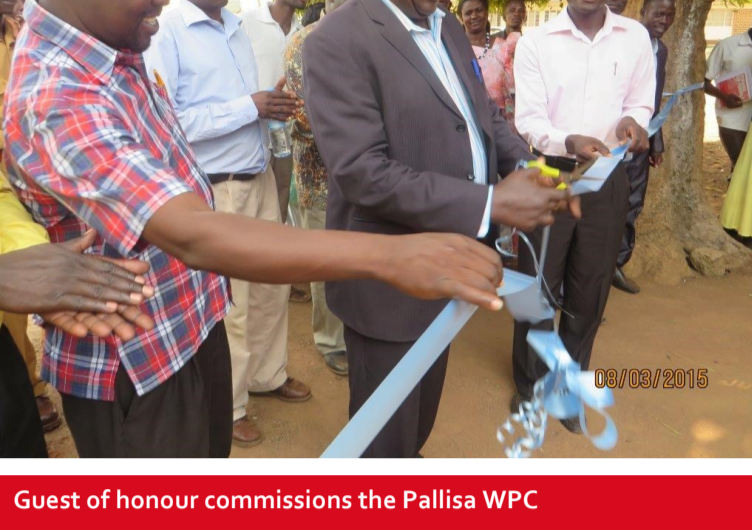
Guest of honour commissions the Pallisa WPC

Pallisa LRP joined the rest of the world to commemorate International Women's Day yesterday. However, rather than celebrate, the leadership was alarmed by the statistics that ActionAid presented to them.