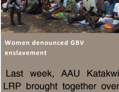
Women denounced GBV enslavement

Last week, AAU Katakwi LRP brought together over 500 women and Girls for a Gender based Violence sensitization forum. The women were drawn from Ngariam, Palam and Mago-ro sub counties of Teso and Karamoja regions.