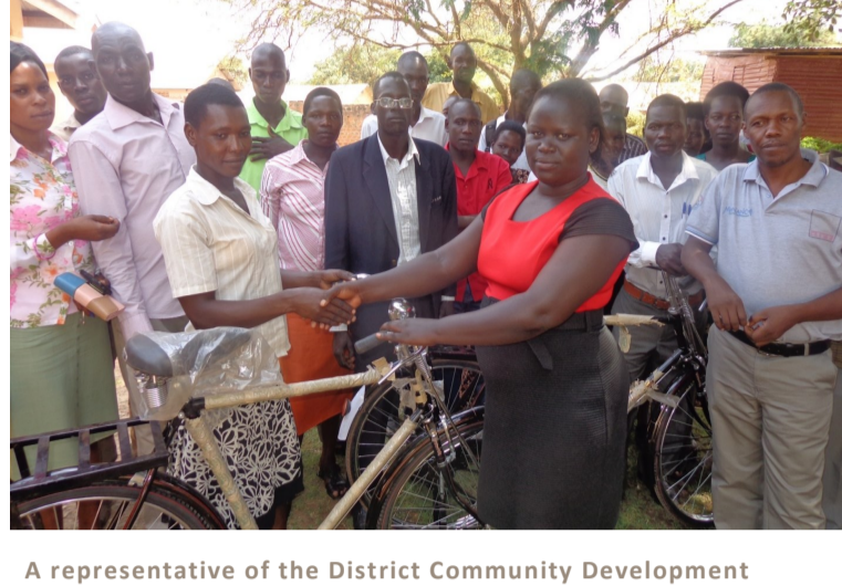
A representative of the District Community Development Officer presents a bicycle to Community Monitor

Masindi LRP was in Lira town last week where a review meeting was convened to assess, among other things, the civic competence of communities through the lenses of 35 ActionAid-trained Community Monitors. Community Monitors have acted as a watchdog for service delivery and distribution of resources in the districts. This has caused an improvement in the way the power bears handle national resources, conscouse that they are being monitored.