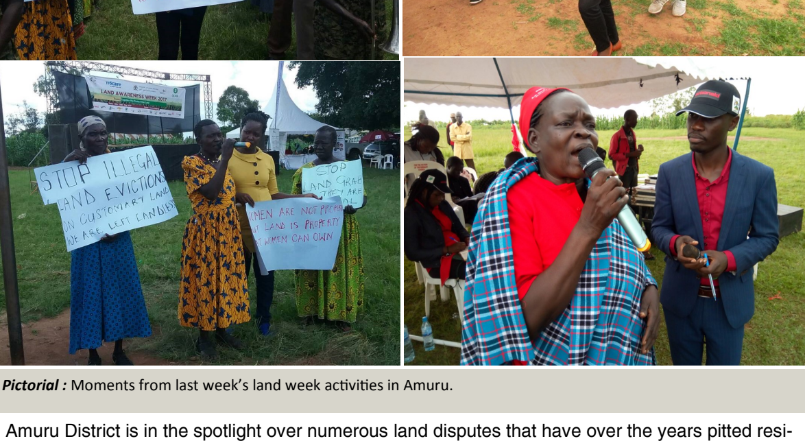
But in a bid to provide platforms for massive community awareness on land rights, ActionAid Gulu Cluster in partnership with the Ministry of Lands, Housing and Urban Development and Participa-

the past years. In some instances, this has led to violent clashes.