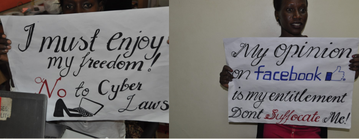
ActionAid staff have joined the campaign against restrictions on freedom of expression. A meeting was held to draw strategies and tactics for the campaign

Last Week, ActionAid held a breakfast meeting with civil society Actors to strategize on a campaign against oppressive cyber laws.