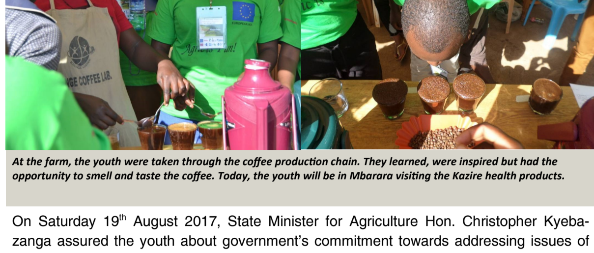
At the farm, the youth were taken through the coffee production chain. They learned, were inspired but had the opportunity to smell and taste the coffee. Today, the youth will be in Mbarara visiting the Kazire health products.