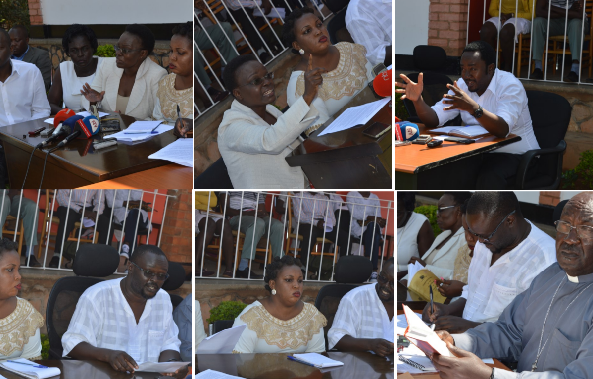
CSO leaders without mincing words affirmed their resolve to ensure that the Constitution is not abrogated during a press conference last Saturday.

Last Saturday, ActionAid together with other CSO leaders during a press conference held at the ActionAid offices called upon the public to either rise up and defend the constitution or else risk being part of the conspiracy that will push Uganda back to anarchy and violence.