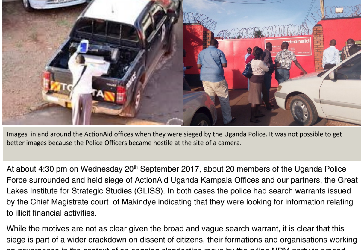
Images in and around the ActionAid offices when they were sieged by the Uganda Police. It was not possible to get better images because the Police Officers became hostile at the site of a camera.

At about 4:30 pm on Wednesday 20 th September 2017, about 20 members of the Uganda Police Force surrounded and held siege of ActionAid Uganda Kampala Offices and our partners, the Great Lakes Institute for Strategic Studies (GLISS). In both cases the police had search warrants issued by the Chief Magistrate court of Makindye indicating that they were looking for information relating to illicit financial activities.