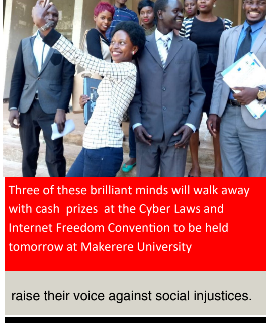
Three of these brilliant minds will walk away with cash prizes at the Cyber Laws and Internet Freedom Convention to be held tomorrow at Makerere University

On Friday last week, Makerere University Students took part in a Paper competition on Cyber Laws and Internet Freedoms. They presented Papers on the existing cyber laws in Uganda, how they shape freedom of expression and made recommendations to enhance freedom of expression for internet users.