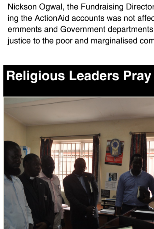
The guests meeting the Finance team