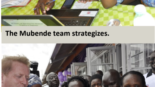
Policy influencers launch the Gulu GBV shelter in 2014.(file photo)