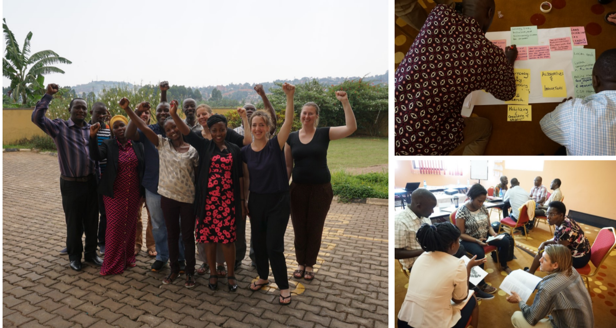
(Left) AAU team joined by the ActionAid Netherlands team and CSO representatives that will be implementing the five year project. Right is the team strategizing in focus group discussions on how best to implement the project for dignity and justice of Ugandans.

Last week, ActionAid unveiled the Fair Green and Global Project at Royal suits Hotel in Bugolobi. The five year project will be implemented in partnership with ActionAid Netherlands, Solidarity Uganda, Legal Aid Providers Network, Recreation For Peace and Development and SEATINI Uganda.