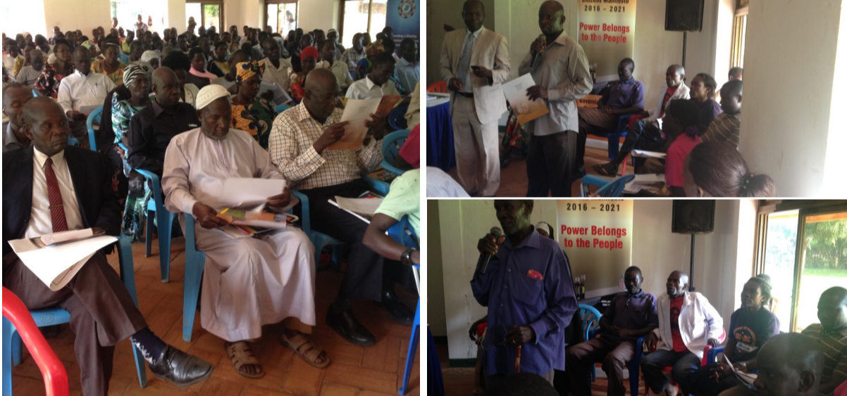
(Right) some of the residents from Bukedi Sub region that turned up for the launch of the region's manifesto. Right are some of the political aspirants during the heated debate. They were challenged to respect the social contract (citizens manifesto) for the development of the sub region.

The people of Bukedi sub region have demanded that their incoming political leaders pay attention to the increased corruption levels in the region, poor quality education and youth unemployment. This was at the launch of the Bukedi Region Citizens manifesto held last week at Country Inn Hotel in Pallisa. The event was attended by over 150 local political, cultural and civil society leaders.