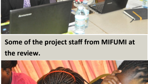
The Mubende team strategizes.