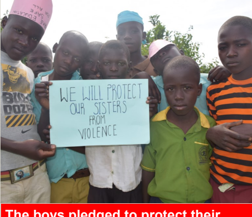
The boys pledged to protect their sisters from violence