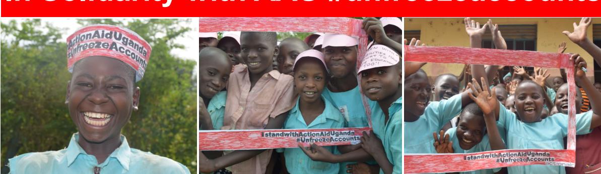
The children of Busiki took off time during the commemoration of 16 Days of Activism against Gender Based violence to stand in solidarity with ActionAid by demanding that the accounts be unfrozen. Some of them are ActionAid Sponsored children.