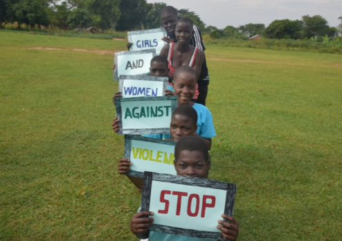
The girls demanded for violence free environments.

“It was my first time to speak in front of sub-county leadership and I am now more confident than ever and will continue fighting for children's rights in my school and community”, she said.