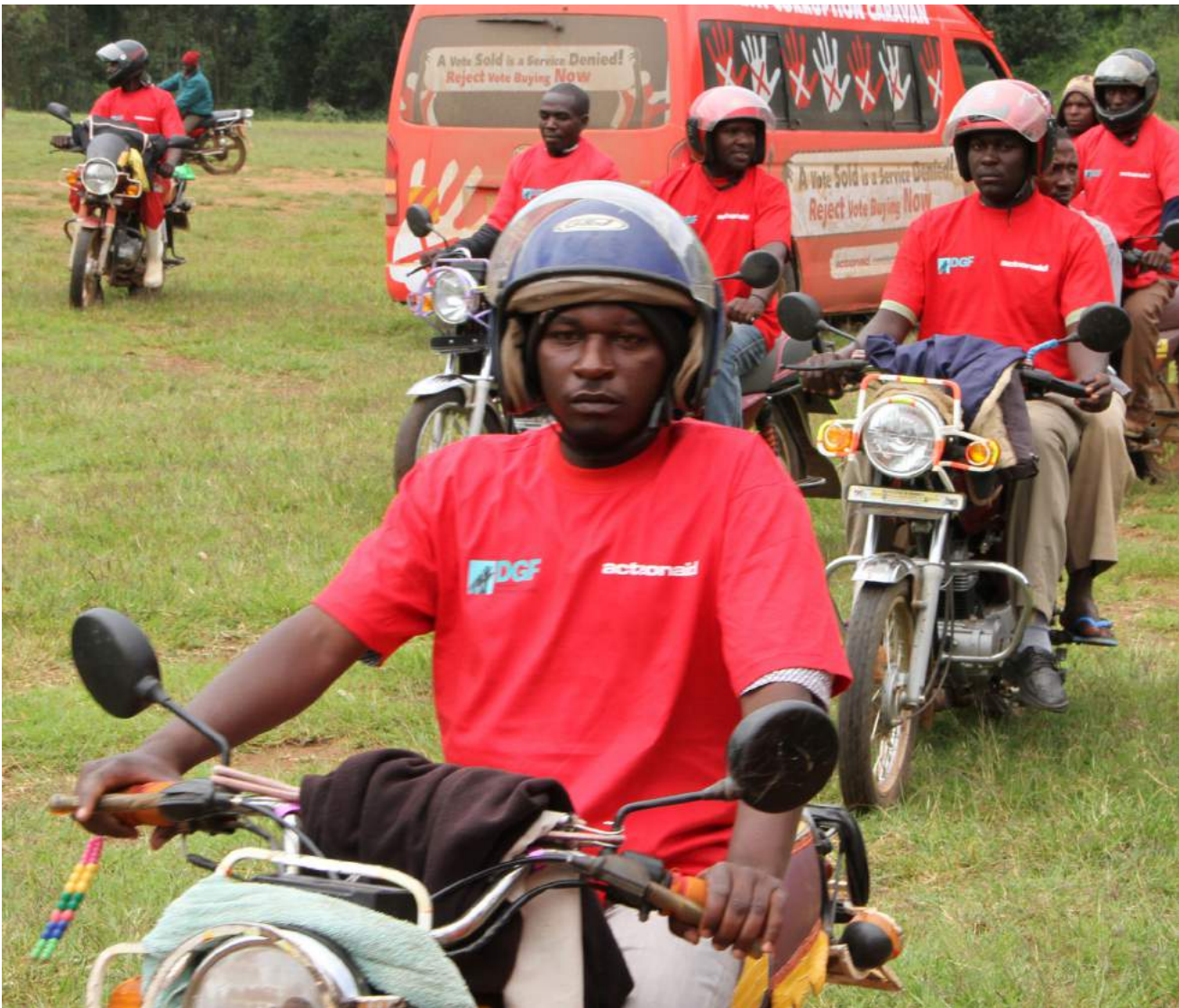
Boda Boda Riders at Muhanga Town in Kabale district, Western Uganda. Transporters get hired by different Politicians to spice up their campaigns