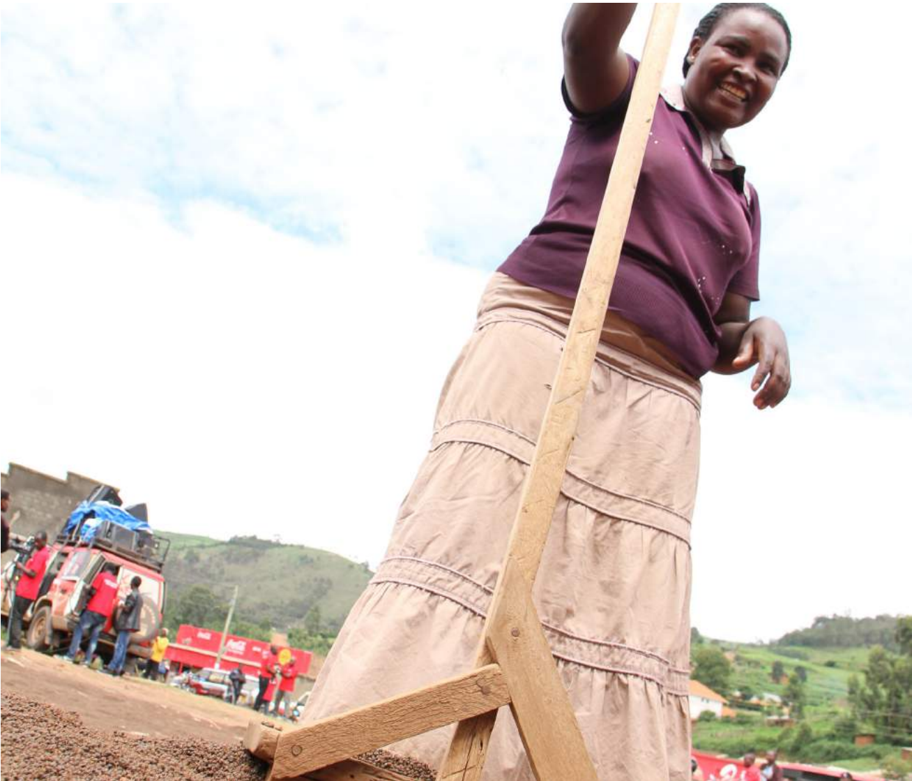
A woman dries sorghum for making local brew "Muramba" at Muhanga in Kabale. It is common place for Voters to demand for alcohol and money from their Leaders instead of Services.