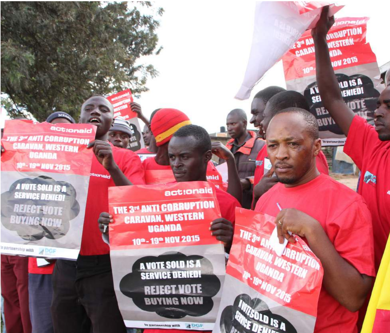
Residents display posters during the Anti- Corruption caravan stop over at Rubare trading center in Ntungamo.