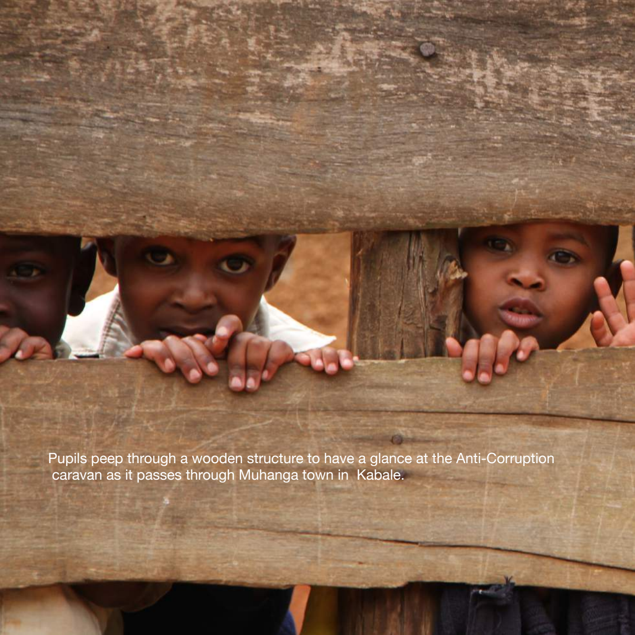
Pupils peep through a wooden structure to have a glance at the Anti-Corruption caravan as it passes through Muhanga town in Kabale.