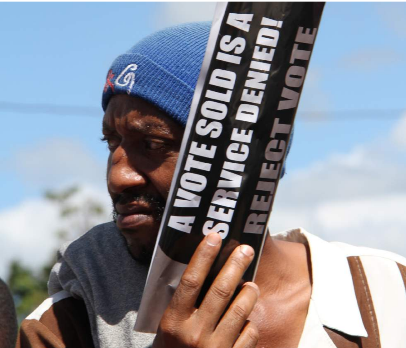
A man displays a poster during the Anti- Corruption campaign caravan rally in Kihhi Western Uganda. Use of IEC Materials has been instrumental in changing the attitudes of people towards corruption in Kigezi region