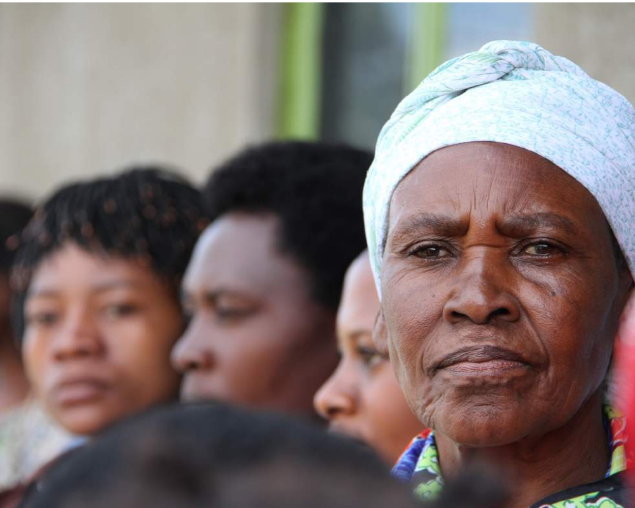
A Farmer waits for buyers of her yams at Katerera in Rubirizi district, Western Uganda. Many Politicians and Middlemen have exploited the rural folks due to ignorance.