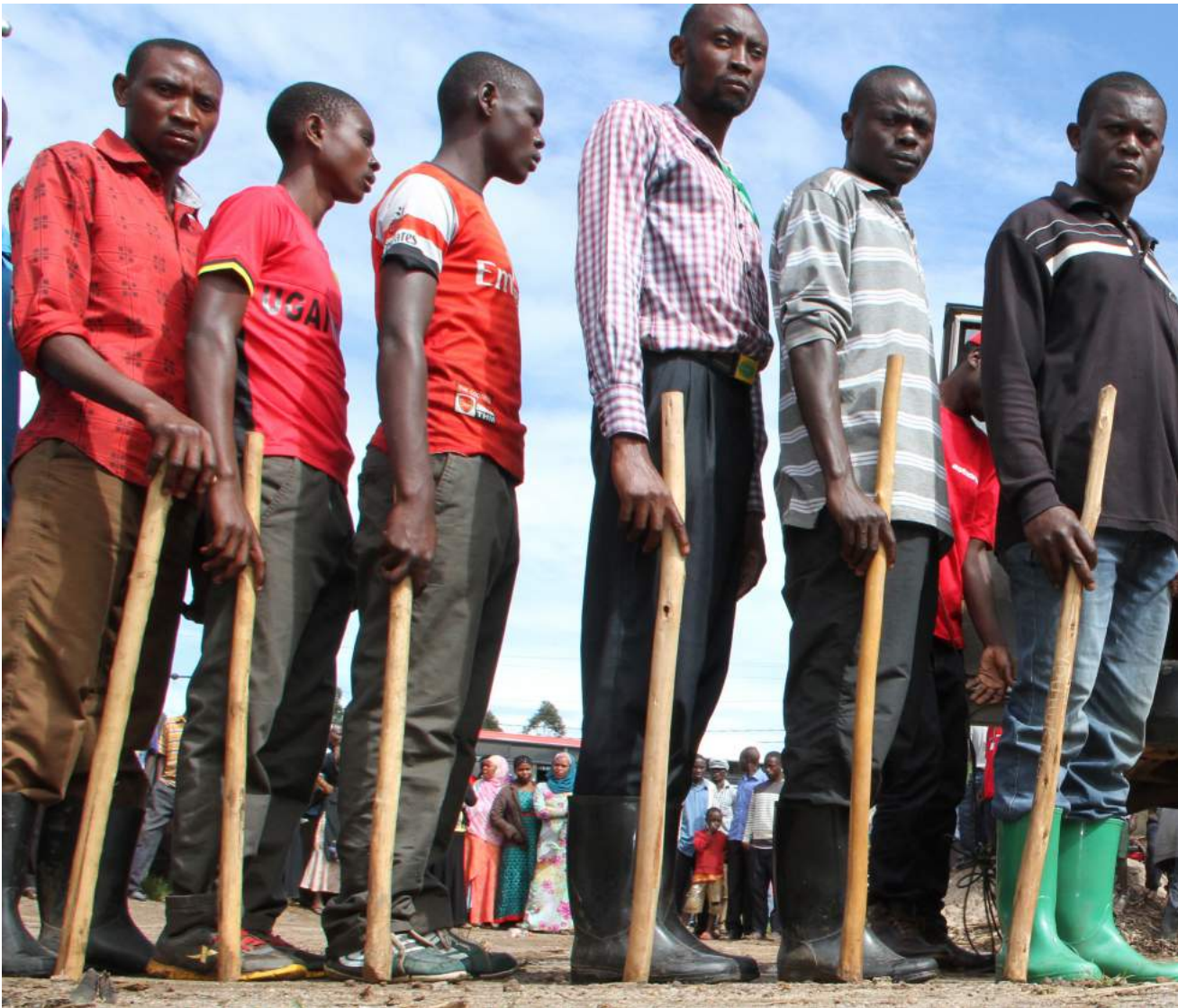
Crime Preventers lining up at Ndekye in Rubirizi District. Many Locals accuse these Crime Preventers of being Crime Promoters in the area as they harass and extort money from them