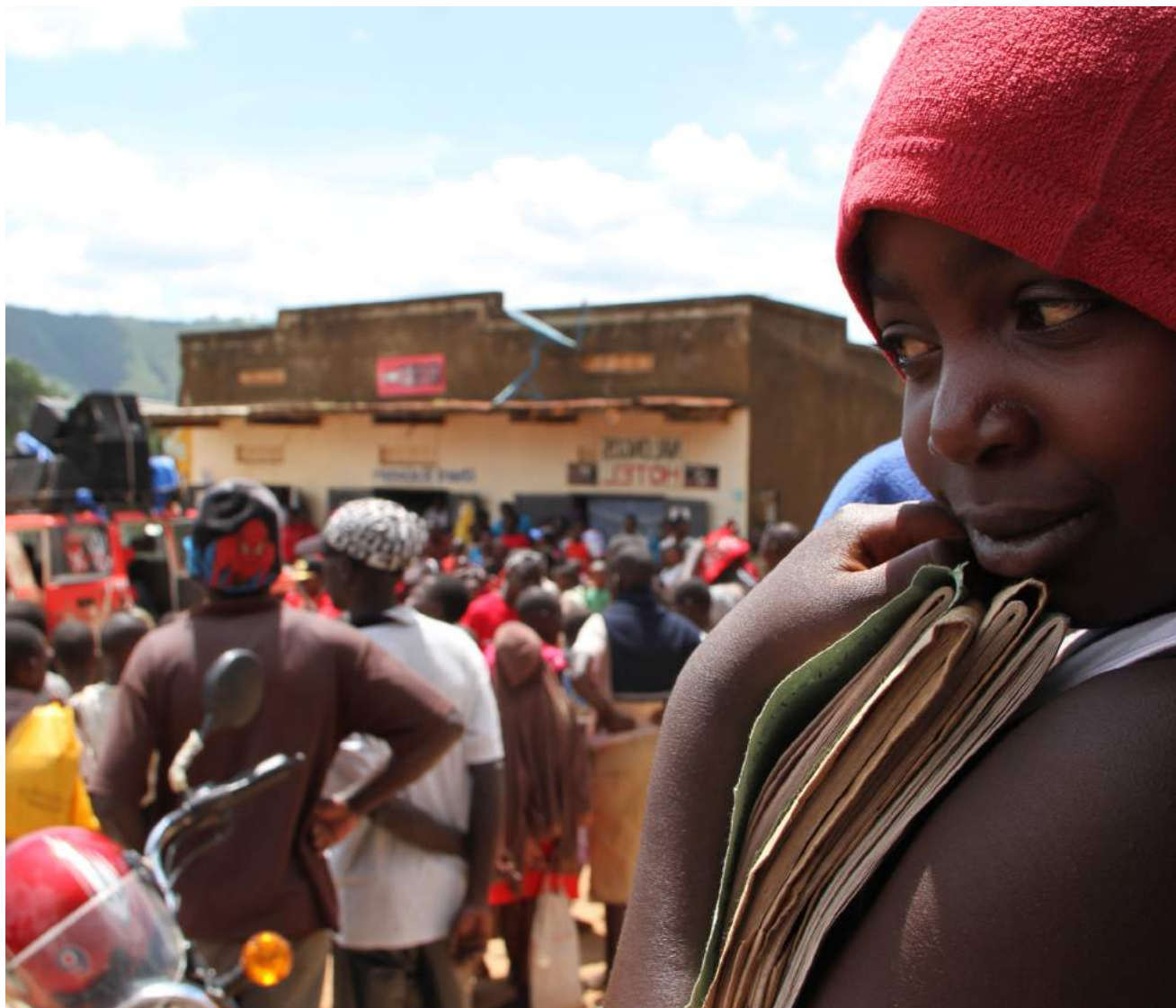
A School girl takes off time to attend the Anti- corruption caravan campaign at Rubindi in western Uganda. The quality of education in most Government aided schools in the area is poor due to poor logistical support from the Government