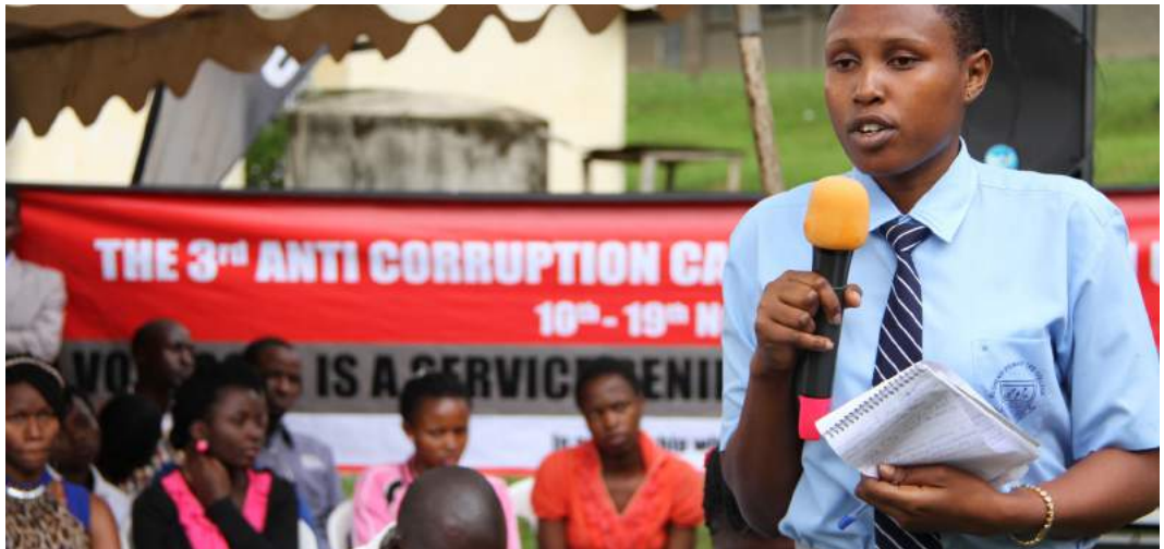
A Students of Bushenyi Primary Teachers' College makes a presentation on Corruption during a debate that was held at the Uganda Technical Institute Bushenyi when the Anti Corruption Caravan visited the Institute.

A Leader is someone who knows the way, shows the way and goes the way. The CSOs show us the way but they don't know the way. I am waiting for that time when CSOs will invite us and tell us the sources of their donor funds. As we preach to the people, we should also walk the talk. I know one day Corruption will end. Our Voters should know the value and power of their vote and all Politicians should shun Vote Buying.