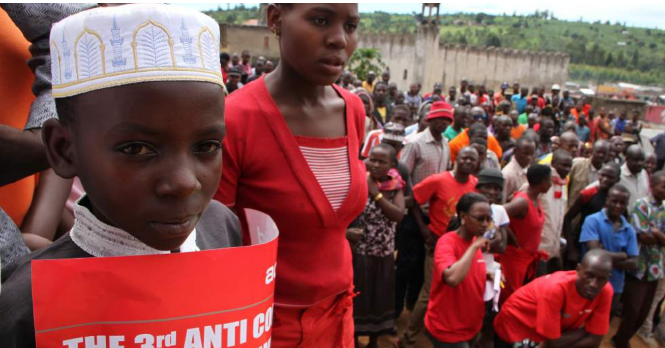
Residents of Rubindi attend the Anti- Corruption campaign in Mbarara District.

This is the beginning of yet another effort by the Civil Society and peace loving Ugandans to come together and change the course. We believe that this should be a partnership and we value the Partnership that we have had in this struggle. We want to thank the Uganda Police Force, WACSO, KICK, RAC, the Media, the Local Governments, DGF and other CSOs that we have worked with on this Caravan. It wasn't just about AAU, but it was all about the Partnerships we have with the CSOs and Government and I would like to thank whoever contributed to the success of the Western Leg Anti - Corruption Caravan.