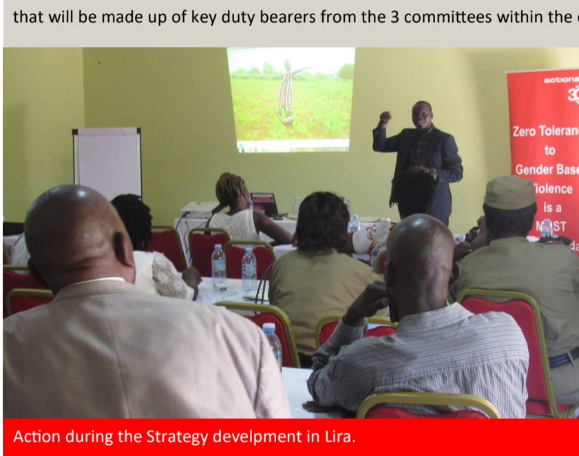
Action during the Strategy development in Lira.

These will ensure the voice of the coalition against GBV is heard and notable actions taken in bringing perpetrators to book. They also committed to information sharing through GBV coalition Whatsapp, SMS and Email groups. The reflection meeting was organized by the ActionAid GBV shelter in Nebbi, in a bid to track progress as we struggle to bring an end to gender based violence in the