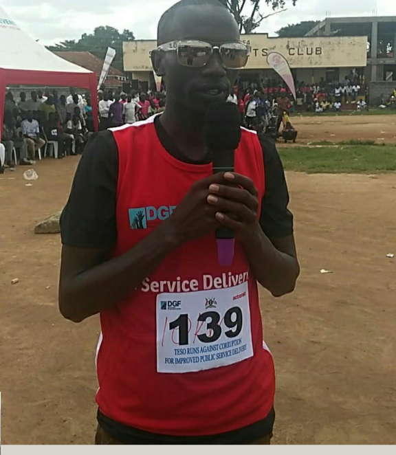
Marathon in pictures. The above pictorial indicates the entire journey of the Teso run for quality public services that took place in Teso, The lead runner, Joshua Cheptegei (in sunglasses) called on an end to Uganda's cancer-corruption!